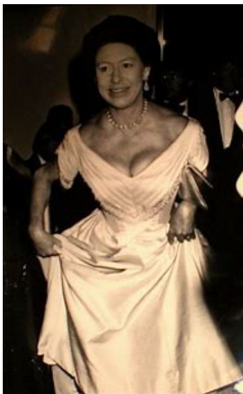
Barak Obama is England Princess Margaret look at her hands