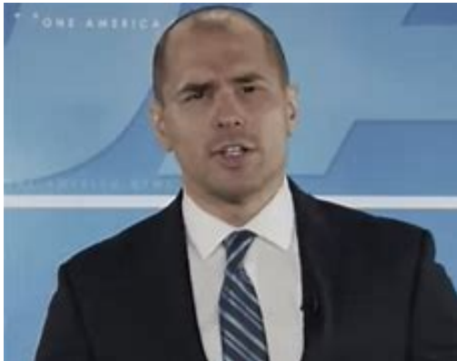
OAN TV Journalist/Jerry Springer/Ted Turner/Howard Stern/Jerryboan