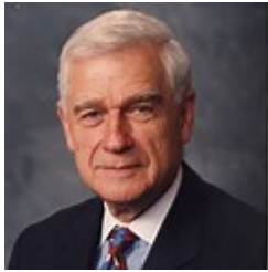
Mark O. Hatfield/Tud Former United States Senator