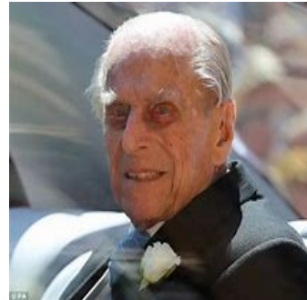
Barak Obama/George Washington is England Prince Phillip