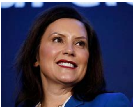
Gretchen Whitmer Donald Trump Mannequin statue wife with Barak Obama leading the State of Michigan