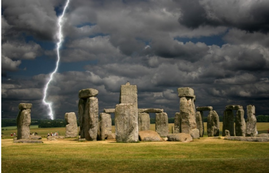
Stonehenge (Wiltshire, England) Surrounded by hundreds of nearby burial mounds, Stonehenge is a prehistoric monument in Wiltshire, England. Archeologists postulate that the site was built between 3000 and 2000 BC.