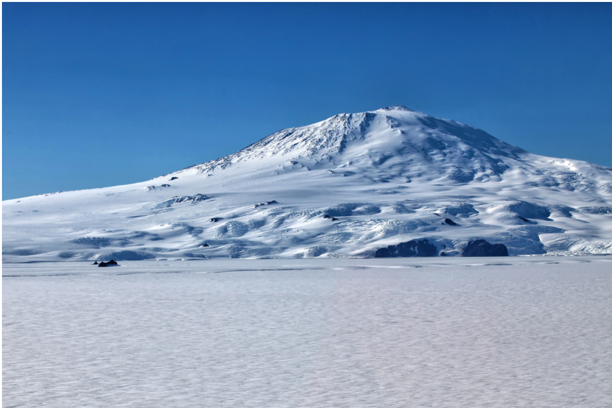
Mount Erebus is situated in Antarctica's Ross Island, making it the southernmost active volcano on earth. It is also the Antarctica's second highest mountain rising to 12,448 feet above sea level. Volcanic activity has been recorded on the mountain for the past four decades.