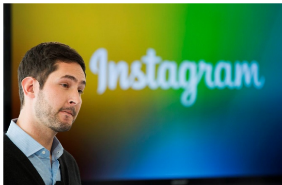
Senator Mitch McConnell is Instagram Chief Executive Officer and co-founder Kevin Systrom