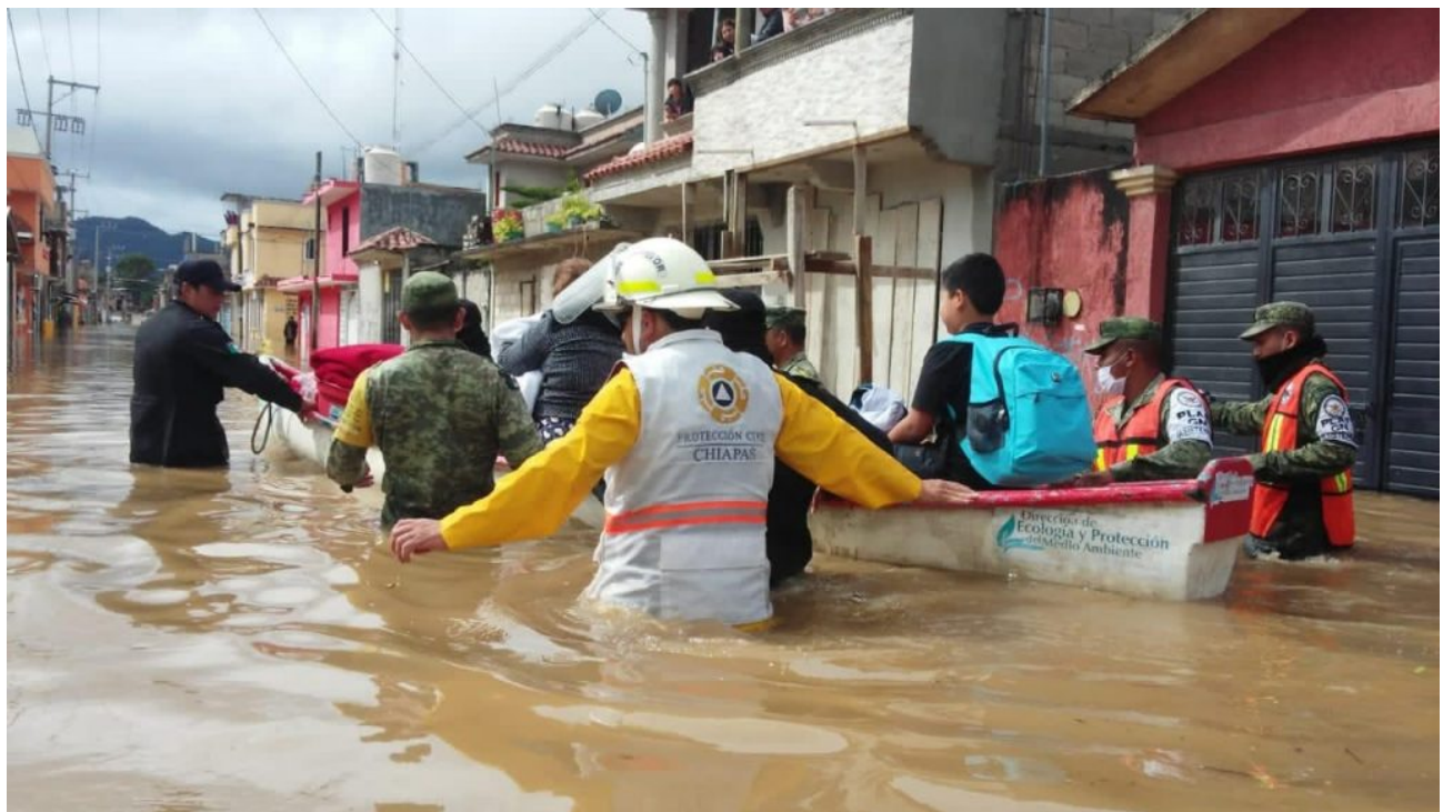
Flood rescues in Chiapas, Mexico, 06 November 2020 after rain from Hurricane Eta.

More heavy rain brought by Hurricane Eta has caused flooding and landslides, this time in southern parts of Mexico. In a 24-hour period to 06 November, 315mm of rain fell in Oxolotán in Tabasco State and 279.5mm in Escalón in Chiapas State, according to Mexico's Servicio Meteorológico Nacional (SNM). Previously Eta had caused devastation across Central America, with dozens of people feared dead in Guatemala, Honduras, Panama, Costa Rica and Nicaragua.