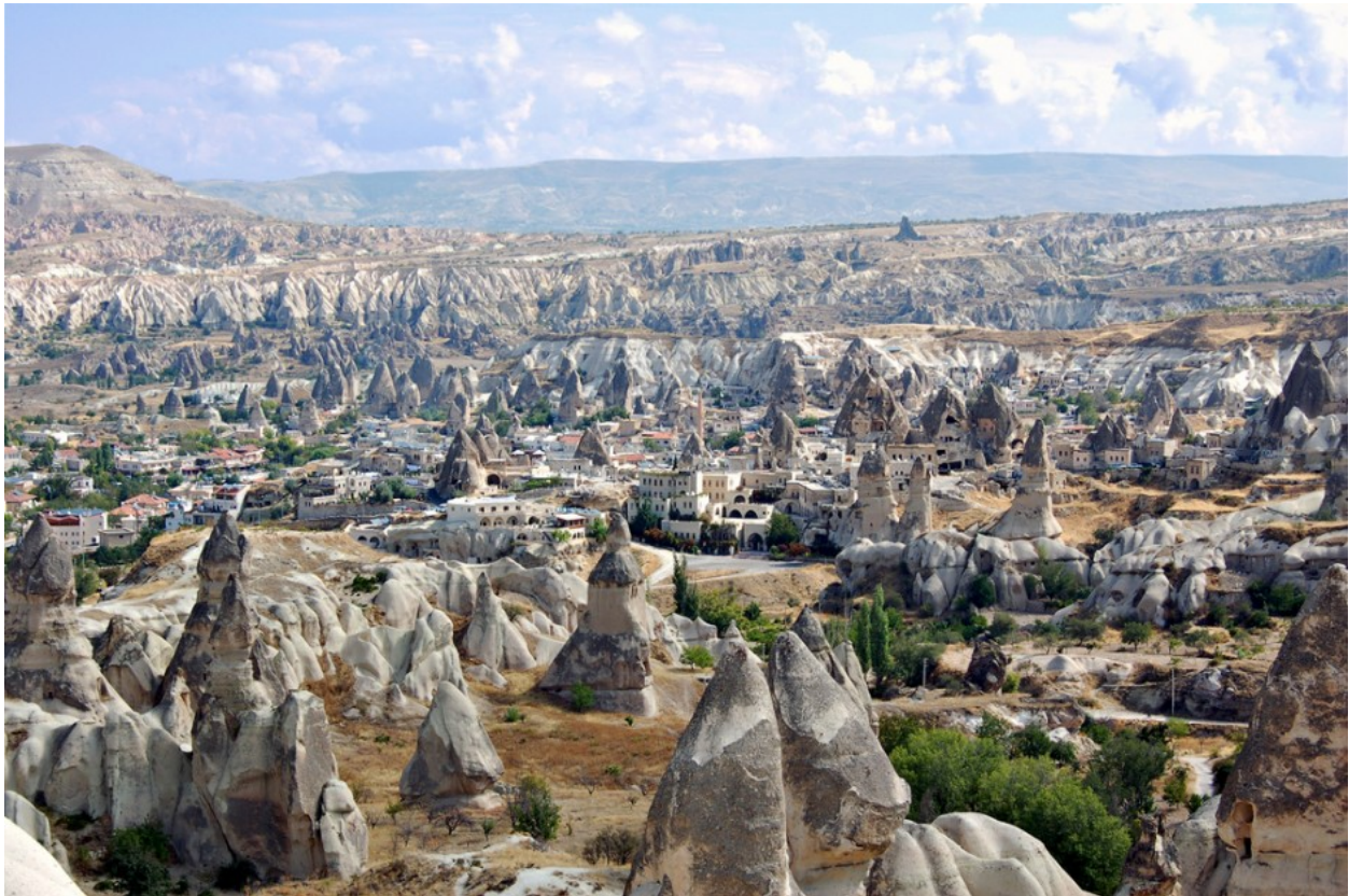
Cappadocia (Central Anatolian Region, Turkey) Cappadocia was the home of the Hittite Empire. Many of Cappadocia's temples and homes were cut directly into the rock structures known as fairy chimneys visible in the photo above. The earliest mention of the region's name dates back to the late 6th century BC.

Antartica that we think is an area covered in freezing ice, is My many states that the devel governments destroyed and then they cover them with ice snow and ink condense scent, so you think no one is still living there. There are many states in those areas and under those areas that the devel republic and democrat governments do not want you to know exist. Antartica means that those states have the tar for our roads and streets that is right for us and the tar that can kill the ant and tic devels. The governments do not want them to exist, so they destroy the Antartica areas connected to our elevations and then they use the military to make snow and to put the snow in the areas to deceive us.