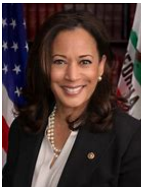
Kamala Harris/Barak Obama Surpent

All of you is not here. You is not here, you is not here, you is not here, you is not here. You is not here, you is not here, you is not here, you is not here. You is not here, you is not here, you is not here, you is not here. You is not here, you is not here, you is not here, you is not here.