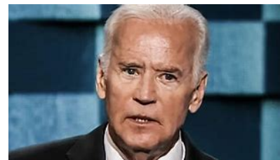
Joe Biden/George Washington/Tud