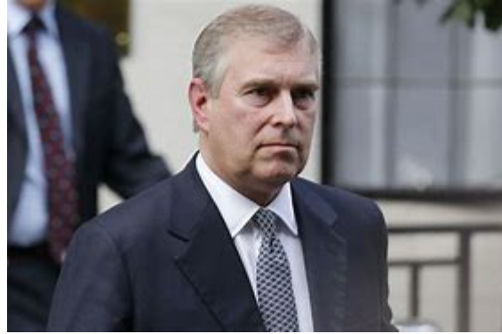
Prince Andrew/ Jack the raper groper gripper ripper–One of America Donald Trump Inside & Hatfield/Tud