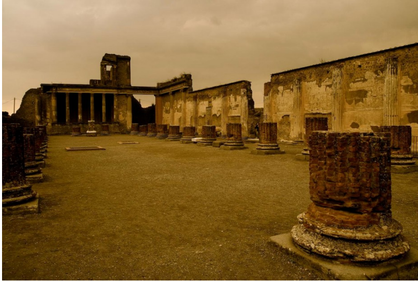
Pompeii (Pompei, Italy) Pompeii, an ancient Roman city near current-day Naples, was destroyed and buried in ash and pumice after the eruption of Mount Vesuvius in 79 AD. Approximately 2.5 million people visit Pompeii yearly.

The Cappadocia, Central Anatolian Region, in My Canstantine states the devel governments call the country of Turkey. It has many huge rocks that are the pillars of this Earth elevations that were tear down by the government devels. A very long time after, many tried to make their houses or homes in the ruin areas. The Pompeii ruins in the Rome states is what is left after the many government destructions of My Children and My properties. The government used planned fires, planned earthquakes, and planned volcano eruptions to continue to destroy these areas and My Children.