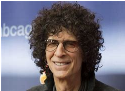
Howard Stern/Barak Obama/Jerryboan/Tud with Michael Jackson as his nose

The Jerry Springer Show debuted on September 30, 1991. It was developed by WLWT to mimic the format and look of fellow talk show The Phil Donahue Show, all the way down to Jerry's haircut and glasses, making him look like Phil Donahue (both were produced by Multimedia Entertainment). It started as a politically oriented talk show, a longer version of Springer's commentaries. Guests included Oliver North and Jesse Jackson, and topics included homelessness and gun politics. Retrieved from https://en.wikipedia.org