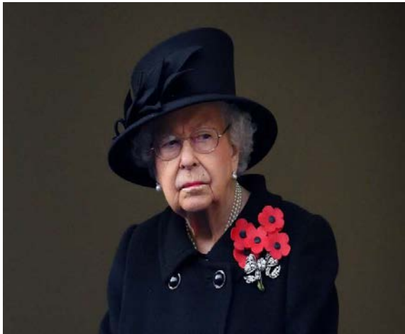
Queen Elizabeth II is Barak Obama wearing my grandmother Gang Gang, and that is one of my grandmother's titles