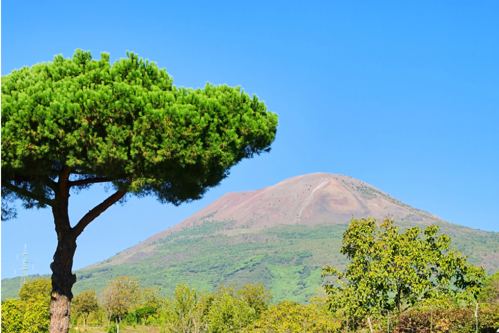
Mount Vesuvius is situated in Italy's Campania region. The mountain is not notably high, as its elevation to the summit is only 4,203 feet, but it is among the most violent active volcanoes on earth.