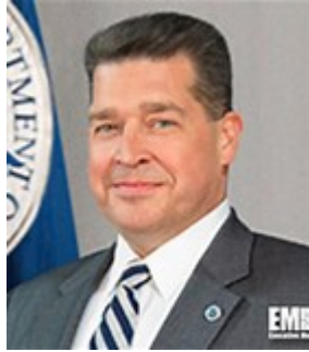
Mark O. Hatfield Jr

Mark Odom Hatfield was an American politician and educator from the state of Oregon. A Republican, he served for 30 years as a United States Senator from Oregon, and also as chairman of the Senate Appropriations Committee. A native Oregonian, he served in the United States Navy in the Pacific Theater during World War II.