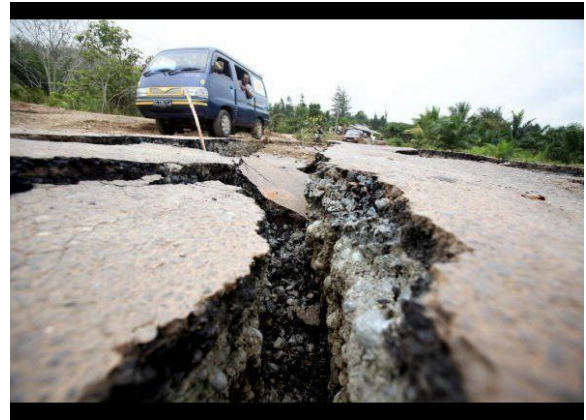
A huge crack appeared in a road in Bohol provinces from 2013-year earthquake in the Philippines