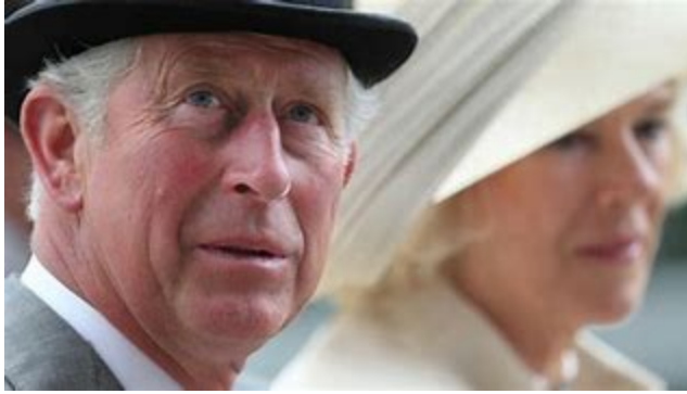
Prince Charles is Obama/Mark Zuckerberg/George Washinton