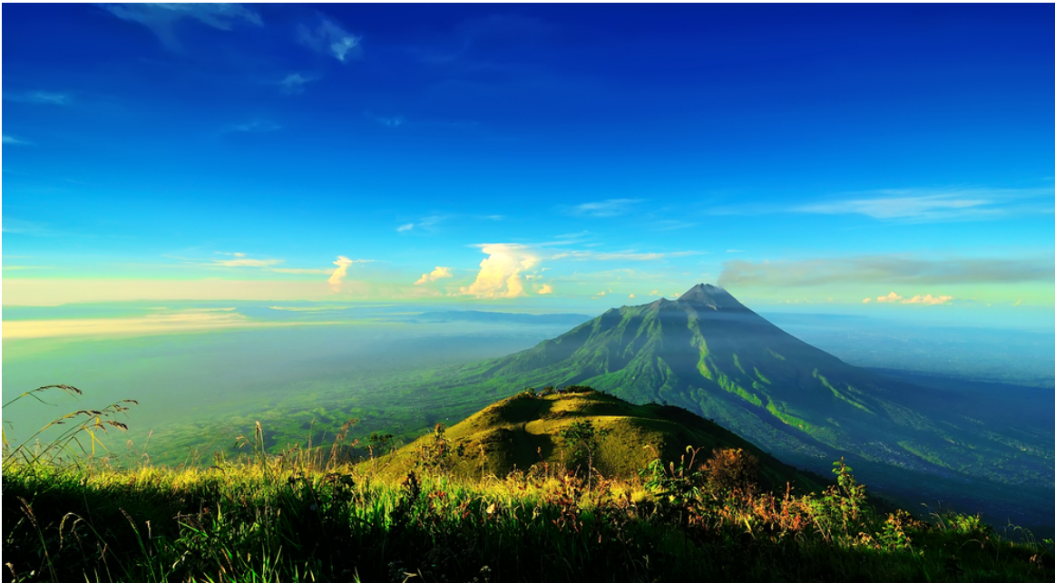
Mount Merapi is an active stratovolcano of average height, with its summit having an elevation of 9,610 above sea level. The mountain is located on the border between Yogyakarta and central Java in Indonesia. The mountain is Indonesia's most active volcano, which explains its name as Mount Merapi translates to Mountain of Fire

The above Mount Erebus volcano/valvecanoe in Antarctica's Ross Island, Mount Vesuvius volcano located in Italy's Campania region, and Mount Merapi active volcano located between Yogyakarta and central Java in Indonesia. is among many volcanoes in this Earth. The volcanoes are many states, many towns, and many cities that the government devels destroyed with fire and explosives. The devel governments in