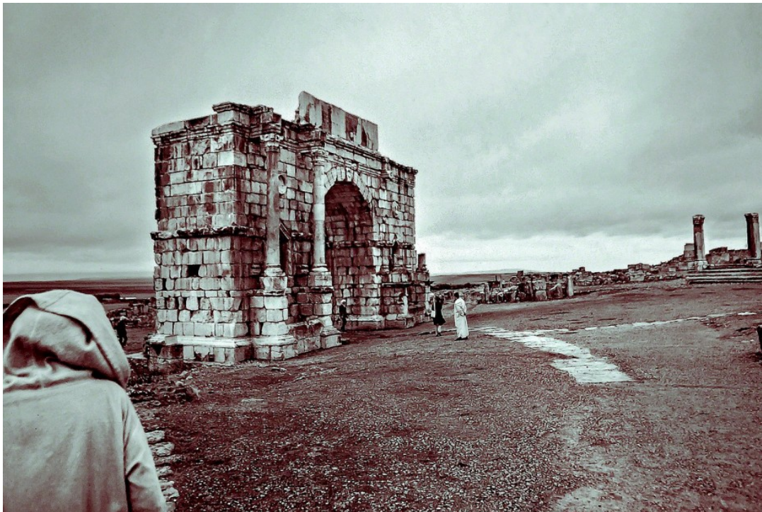
Volubilis, Meknès-Tafilalet in Morocco. A partially excavated Roman city founded in the 3rd century BC, Volubilis was originally a Phoenician settlement. The city was abandoned around the 11th century AD when Morocco's seat of power was relocated to Fes.