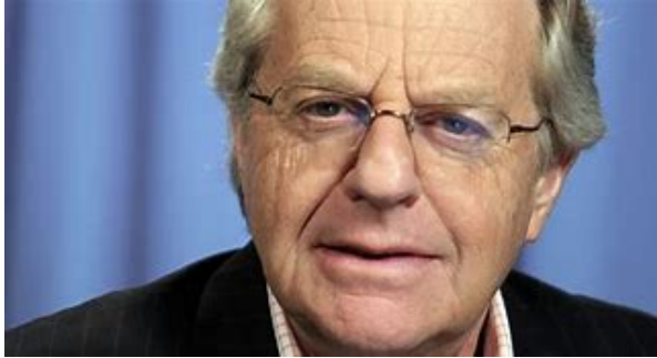
Jerry Springer/Jerryboan/Tud with Michael Jackson as his nose

The Jerry Springer Show debuted on September 30, 1991. It was developed by WLWT to mimic the format and look of fellow talk show The Phil Donahue Show, all the way down to Jerry's haircut and glasses, making him look like Phil Donahue (both were produced by Multimedia Entertainment). It started as a politically oriented talk show, a longer version of Springer's commentaries. Guests included Oliver North and Jesse Jackson, and topics included homelessness and gun politics. Retrieved from https://en.wikipedia.org