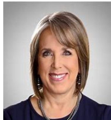
Barak Obama is same as Michelle Lujan Grisham -New Mexico Governor