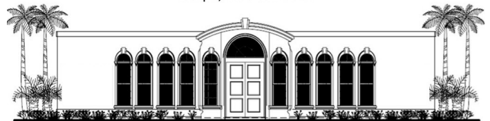
Architect concept drawing

6209 S. Dale Mabry Hwy Tampa, Florida 33611