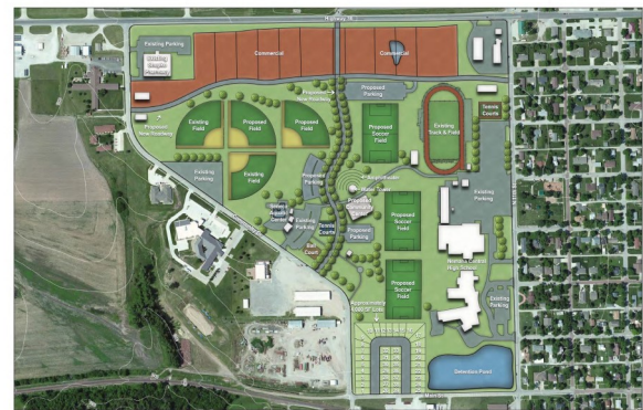
MASTER PLAN CONCEPT | SENECA, KANSAS