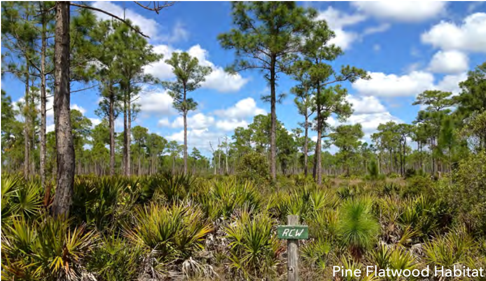
Pine Flatwood Habitat