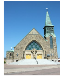
Saint Augustine's 340 Dominion Street Moncton, NB