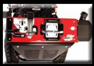
Easy controls operate the track drive and cutter wheel