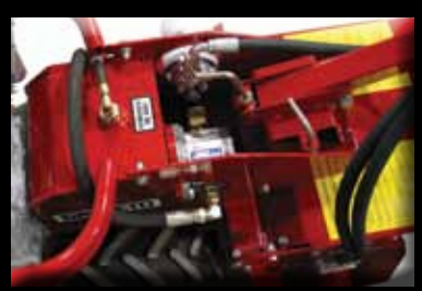
All hydraulics are easily accessed for maintenance and repair