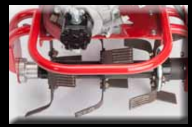
The hardfaced tines are reversible making it easy to dislodge obstructions

CONTACT US 1-800-525-7348 info@barretomfg.com