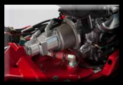
The engine is coupled to two gear pumps: a larger pump drives the cutter wheel and a smaller pump works the tilt and swing