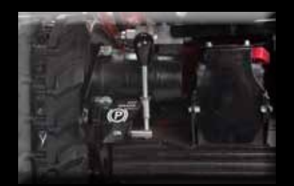
Counterbalance valves on each track drive prevent the track motors from slipping