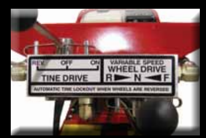
Simple controls are easy to learn and easy to operate