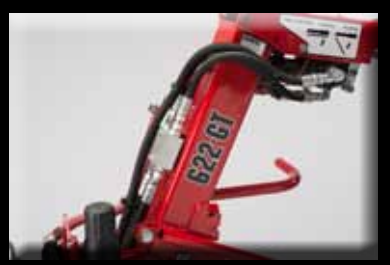
1.5 gallon hydraulic reservoir reduces maintenance costs