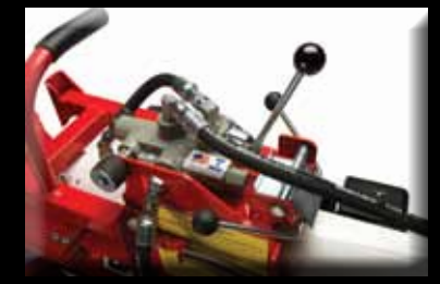
Two handed control provides operational safety