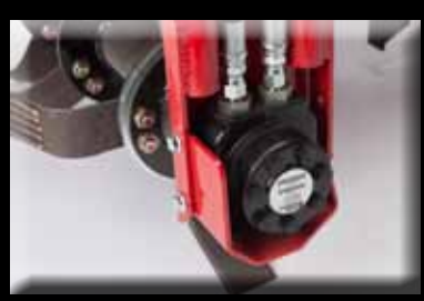
The protected tine motor provides hydraulic direct drive to the shaft