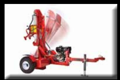
The rugged, heavy duty design will hold up to the challenges of the job