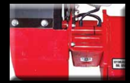
Torsion axle suspension

CYLINDER OPTIONS 20 ton (4") or 22 ton (4 1/2")