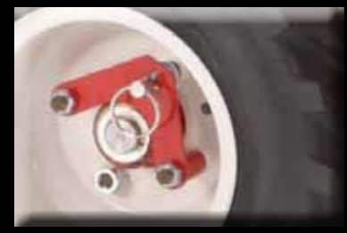
Hubs unlock to free-wheel the tiller when the engine isn't running