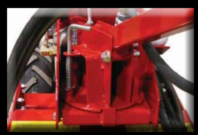
Pivoting handlebar allows closer tilling along houses or fencelines