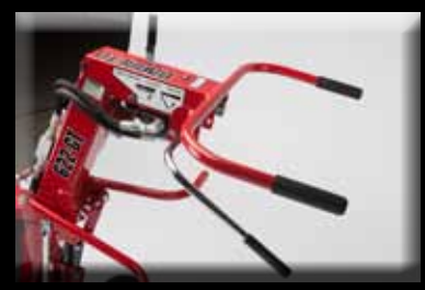
Adjustable handlebars feature a one lever control to enage tines