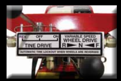
Simple controls are easy to learn and easy to operate