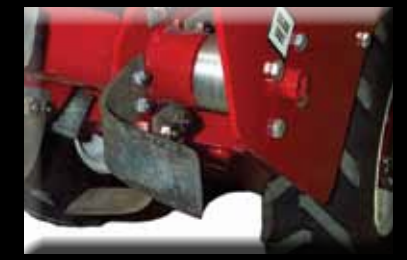
Counter-rotating tines cut through sod and hard packed soil

CONTACT US 1-800-525-7348 info@barretomfg.com