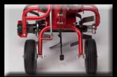
Tilling depth can be adjusted by setting the wheel height