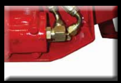
Hydraulics are easily accessed for maintenance and repair