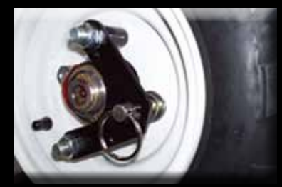
Hubs unlock to free-wheel the tiller when the engine isn't running