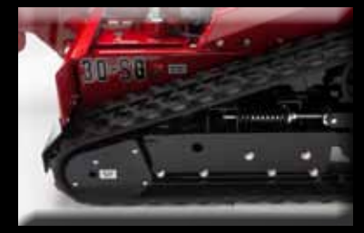
Time-tested track design absorbs impact and provides stability