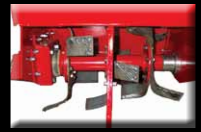
Hard faced, counter-rotating tines cut through sod and hard packed soil

CONTACT US 1-800-525-7348 info@barretomfg.com