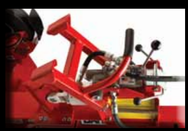
Spring loaded wedge cleaner