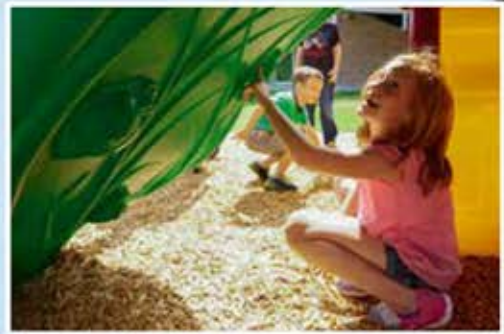
Vine Climber features nature details underneath!