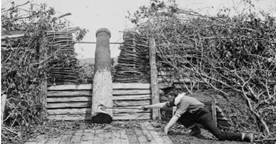
1 of 10 Preposterous Military Hoaxes That Worked