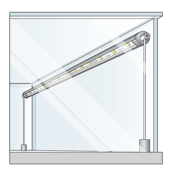
Pivoting Rod System