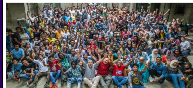
Children helped by StARS in Cairo