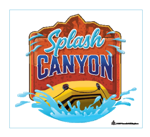
Vacation Bible School July 15-19