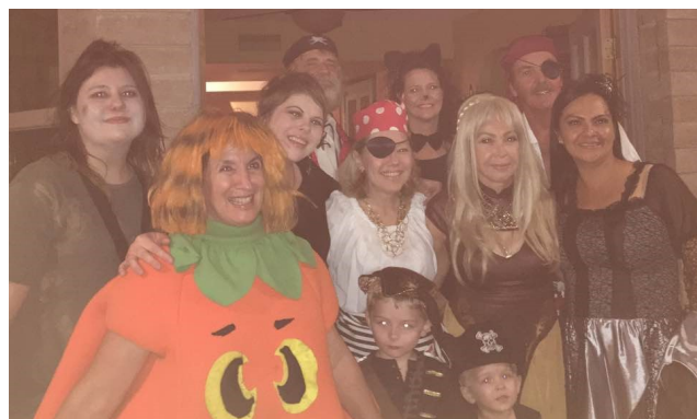
Tempe RW: Tempe members having fun at their Halloween Potluck - notice the dead Democrat voter on the left!