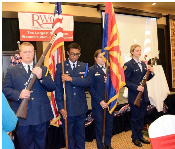
Yavapai County RW: Prescott High School Color Guard presents the colors at the YCRW Toys for Tots event.