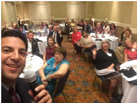
Central RW of Phoenix: Candidate to represent Maricopa County for Central Arizona Water Conservation District takes a selfie!