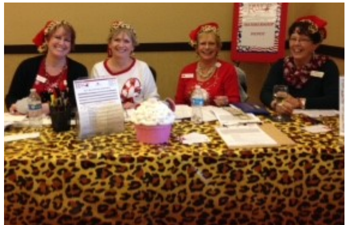
RW of Prescott: The Membership Team greeting everyone at the Christmas Luncheon.