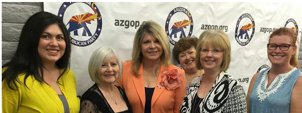
Central RW of Phoenix: CRWOP volunteers with RNC Vice-Chair Sharon Day at AZGOP Headquarters.

Clubs: Arrowhead RW, Central RW of Phoenix