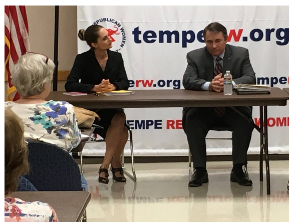
Tempe RW: TRW October GMO debate between GMO-free AZ and the director of the AZ Dept. of Agriculture. (You can watch the debate on YouTube by searching for Tempe Republican Women.)