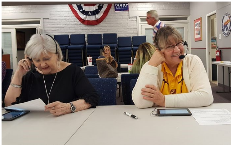
Central RW of Phoenix: CRWOP Call Night volunteers at AZGOP Headquarters.