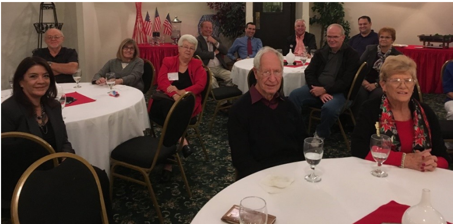
Pima County RW: A scene from the club's holiday party.