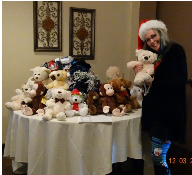
Arrowhead RW: Generous Arrowhead RW members! Donations of stuffed bears for Phoenix Children's Hospital patients.