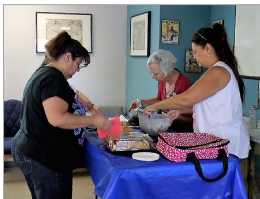
Graham County Republican Women: Each month different GCRW members take turns serving all the members a delicious lunch.