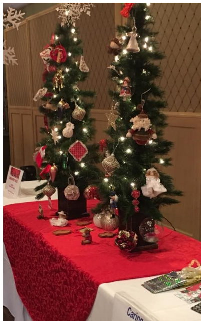
Yavapai County RW: At the annual Christmas party, the sale of beautiful and whimsical ornaments raised funds for the local food bank - just one of the ways YCRW combined a fun event with Caring for America.