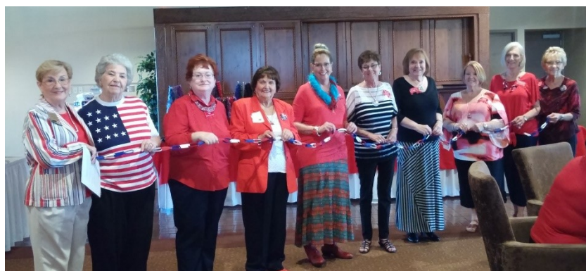
Arrowhead RW: November - Excited for a new year with installation of the 2017 Arrowhead RW Executive Committee!