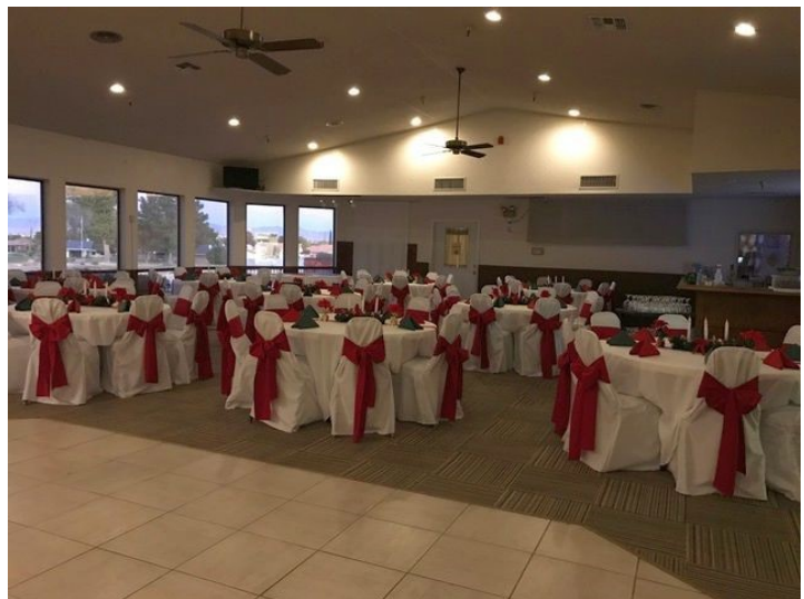
Kingman RW: The room's all ready for our annual Christmas dinner held on December 6, 2016.