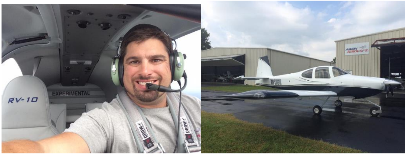
The RV-10 First Flight and After

The RV-10 that the factory worked on with the builder has since flown and I suppose the builder will get there eventually to pick up his airplane. It is certainly a beautiful airplane