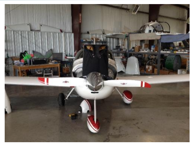
Fourth Quarter 2017 Volume 10, Issue 4