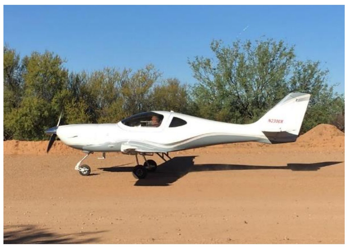
First Flight Complete

There are a couple more things going on at Lightning Aircraft West, there is a fly-in the last week of January and there is a possible new Lightning build beginning in January.