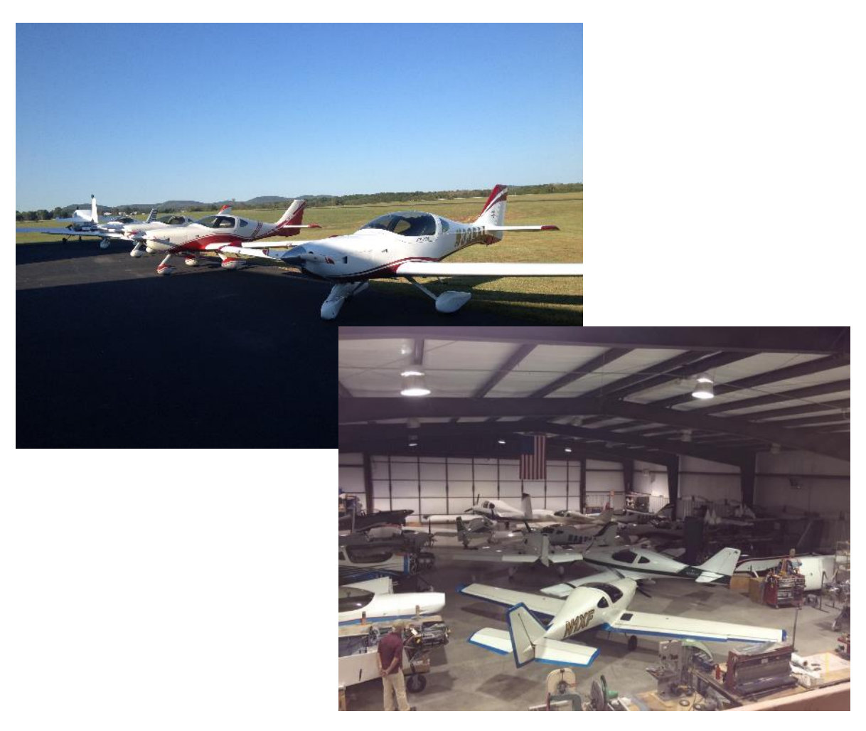
Another Couple of Photos from the Lightning Homecoming