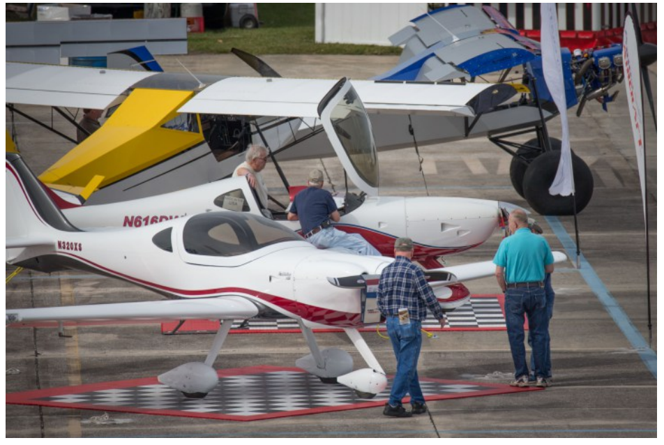
LSA Expo - Sebring, FL Airport Identifier - KSEF