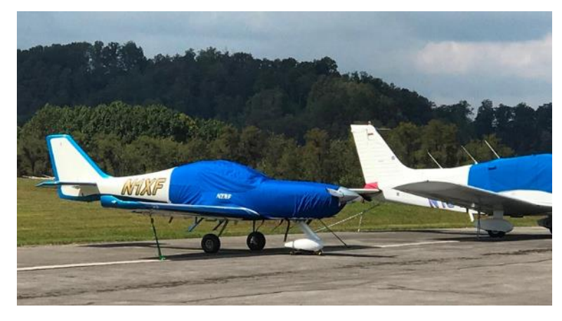
Looks like Val had to spend the night at Lonesome Pine, VA