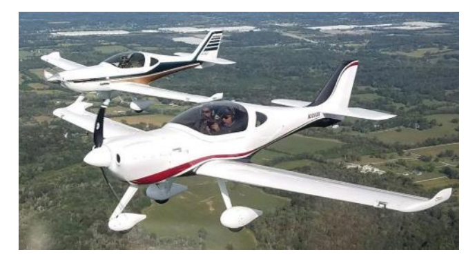
Formation Back from Lebanon, TN