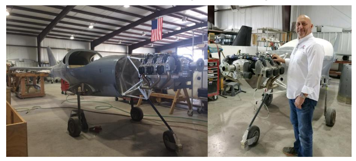
UL520 Mounted - Ray Lawrence from UL Power