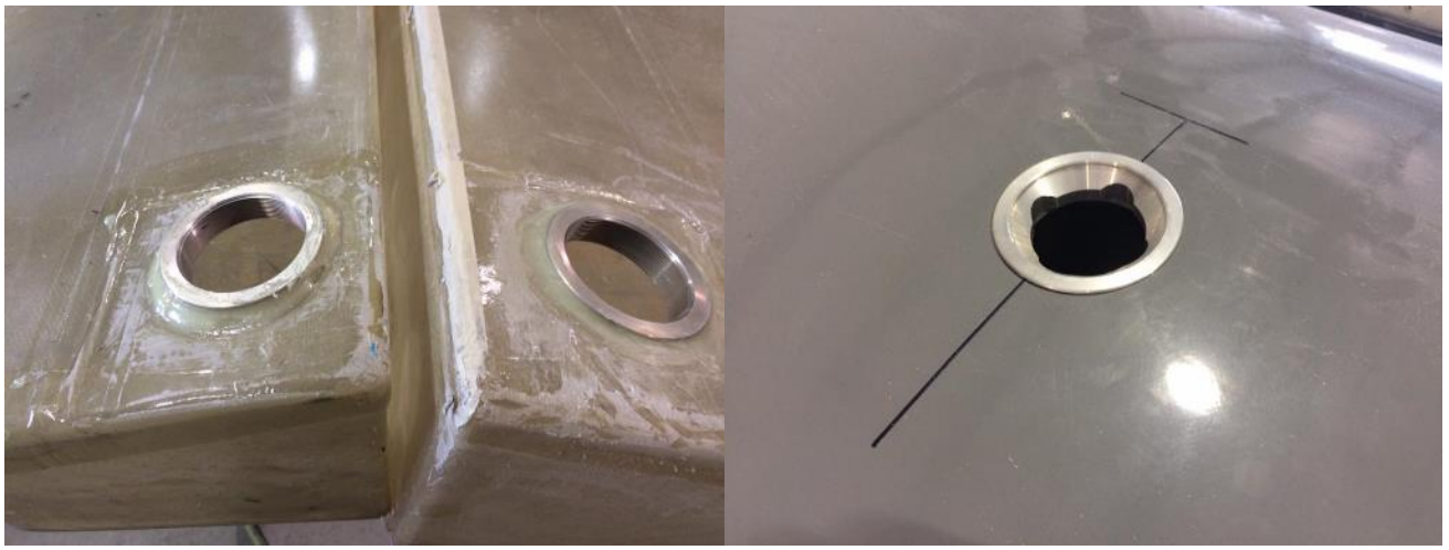
Tanks for the UL Powered XS

The RV-10 that the factory worked on with the builder has since flown and I suppose the builder will get there eventually to pick up his airplane. It is certainly a beautiful airplane