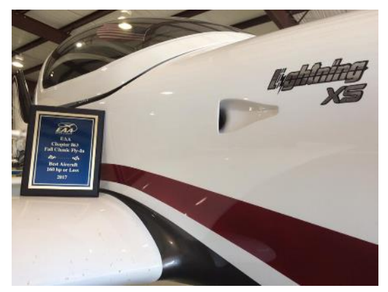
Best Aircraft - 160 hp or Less

Evidently, they were judging airplanes at Lebanon. Son in a few days Nick got a little plaque from the fly-in.