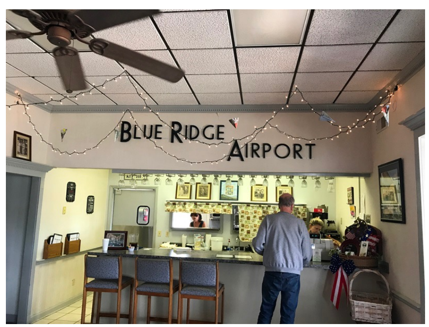
The Lunch Counter at Blue Ridge Airport in Virginia

I've been doing this newsletter for quite a while now. Four years to be exact. Doing it right takes a lot of time, you really don't want to know how much. And if you did, when I get too old and tired of doing it, I may not be able to pawn it off to some younger guy or gal. So, I think I'll keep doing it. Writing the newsletter is fun and it keeps me up to date with what is happening with the Lightning.