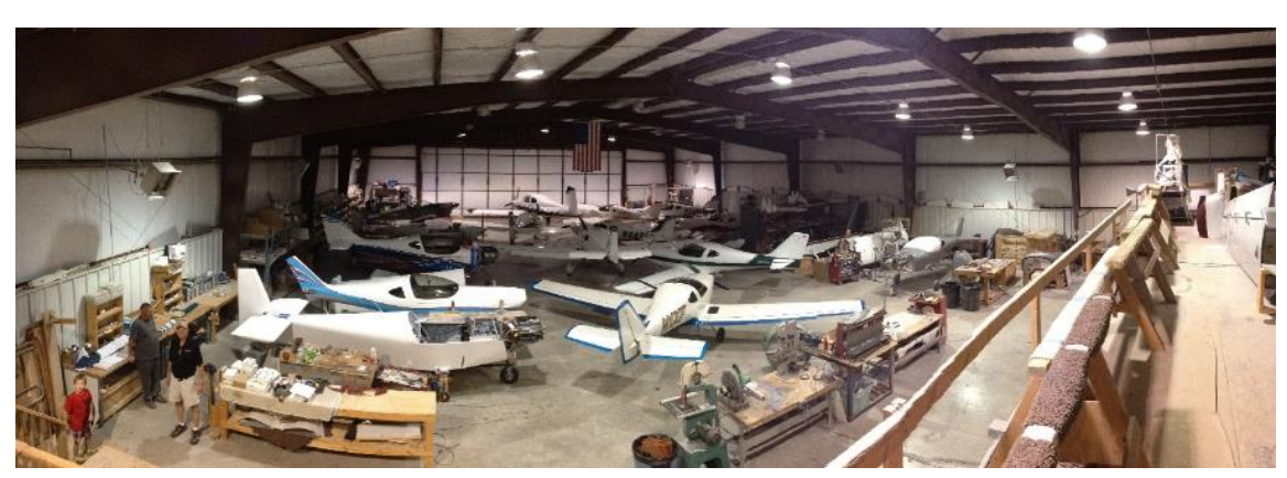
Lightning Homecoming 2017