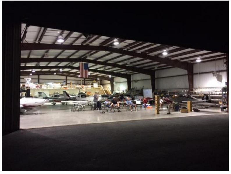
Evening at Arion Aircraft

This year was a really nice time at the Lightning Homecoming. For those that made it, thanks for the effort to get to Shelbyville, TN (KSYI). It was great to see you all. For those that didn't, well there is next year and I hope to see you there. The weather in Shelbyville was great. Not too hot, not too cold and although there were some reported bumps for the air race, it wasn't as bumpy as last year.