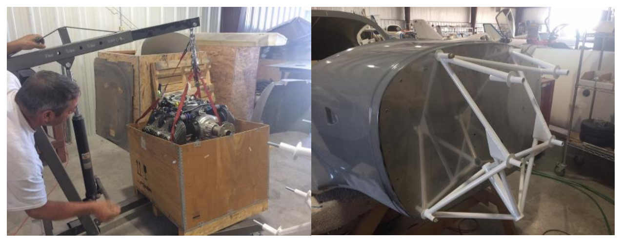
The UL520 and the XS Fuselage with the Engine Mount

They also have another XS in the build cycle. This one has a UL5620 engine, rated at 200 hp! I can't wait to see how this one does.