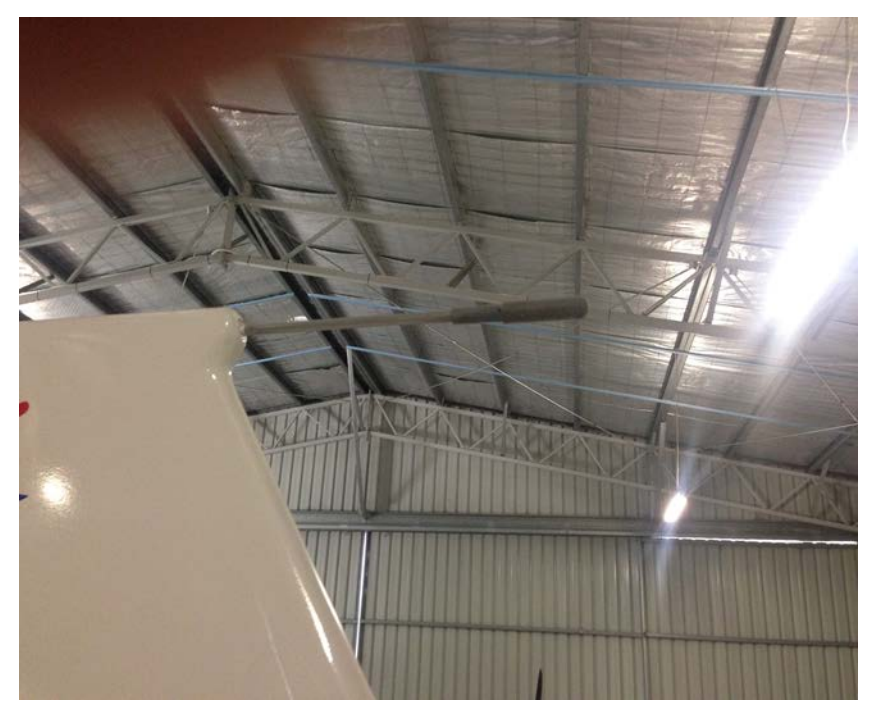
Jabiru Static Port high on Vertical Stabilizer

This configuration was installed on my aircraft (see picture) and tested by flying three headings at about 180, 60 and 300 degrees. Altitude was 3000 feet and indicated air speeds were 115, 95, 75, 70 and 50 Knots. The very accurate data generated by the Dynon Skyview was entered into an Excel calculator (below). This calculator is freely available on the web. The pitot, by the way has always been in the standard location under the right wing.