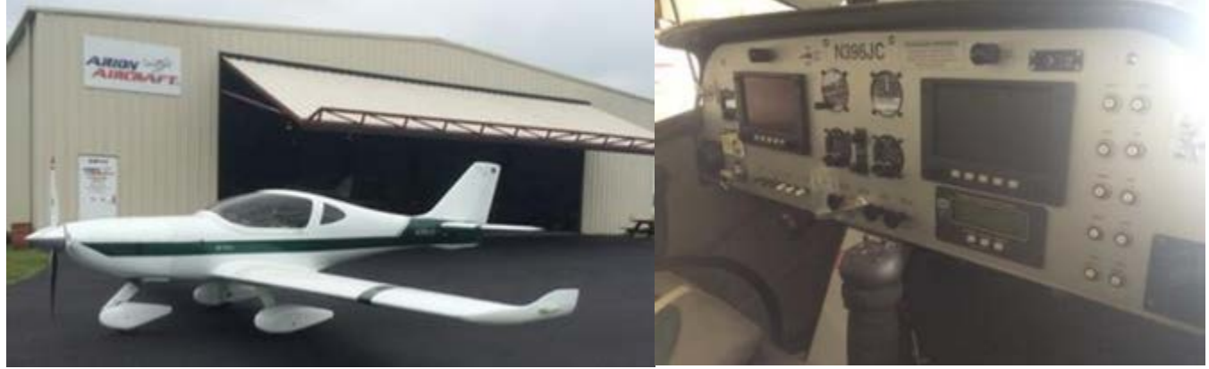
N214DG Experimental – Light Sport Compliant, Located at Geronimo Experimental Aircraft, in Marana, AZ