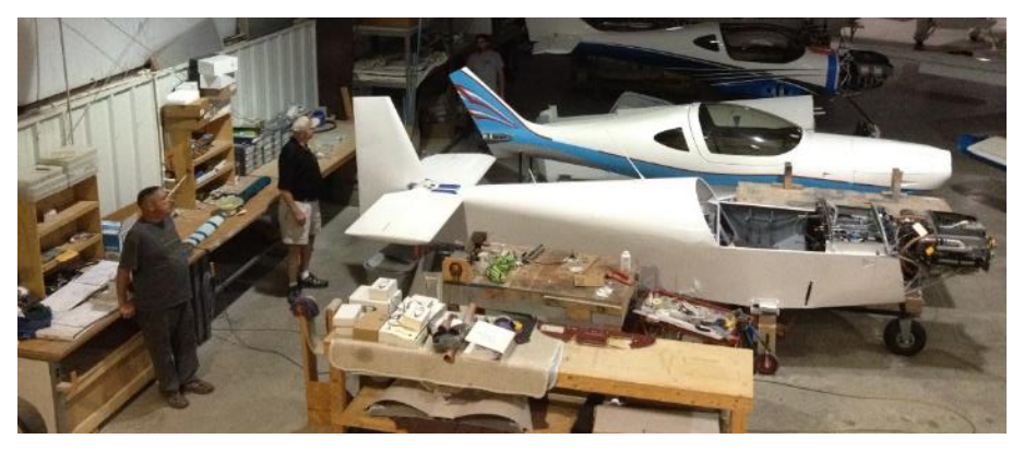
Corvair Powered Zenith 650 in Process

The new demonstrator airplane is still a work in progress. If you saw the work going on at the factory, you would not be surprised. They are building two assists with builders that are building Zenith 650 aircraft. One has a Corvair conversion engine and one has a UL Power engine.