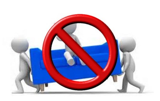
Lift or move any object weighing more than 20lbs