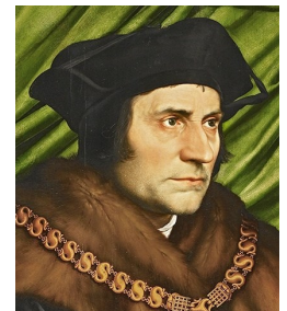
Feast Day: June 22

Four hundred years later, Thomas More was canonized a saint of God. He is the patron saint of attorneys, politicians, and public servants.