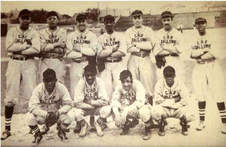
Cab Calloway Baseball Team

Available for Interviews Legends@nlhof.org or call 240.353.1748.