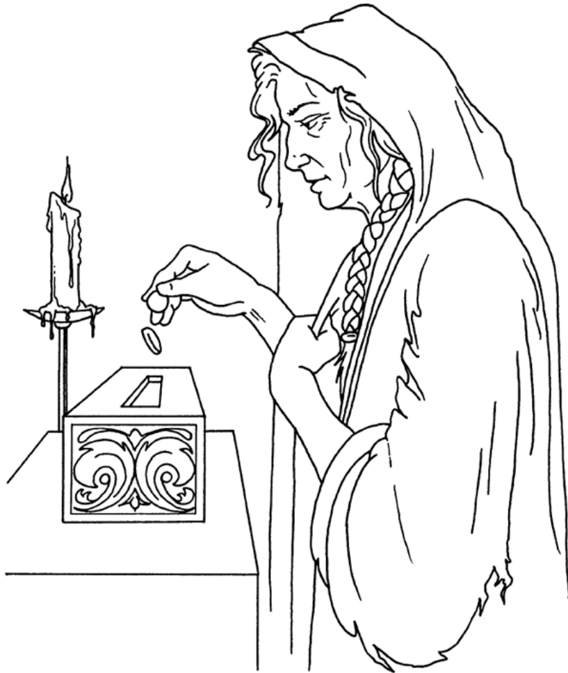
The Widow's Mite

Each number represents a letter of the alphabet. Substitute the correct letter for the numbers to reveal the coded words.