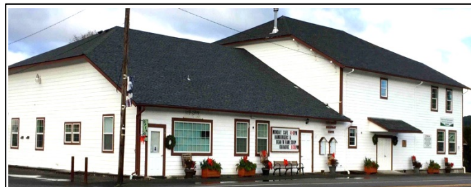
Community Hall (above) and the Infirmary (below) can be seen in the lower left photo. The significance of the First Aid Station is all the babies who were born there. Known as Pioneer Hall since 1957, the building was placed on the Cowlitz Co. Historic Register in April 2017.