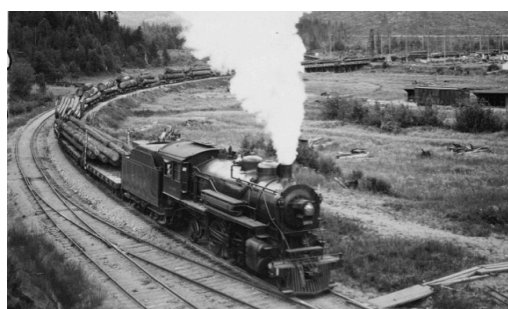
Mile-long trains made the trip to Longview sometimes 3 times a day.