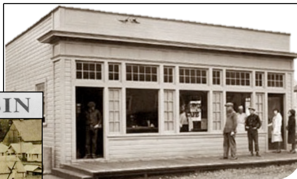
The Church (middle right) was built in 2 stages. Architect E. N. Larry designed it and Café (L) and Post Office (R). The Café was converted into a Library for the retirees.