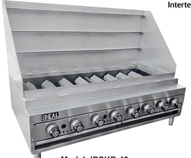
Model: IDSKB-48 (w/ Optional Skewer Level Racks)