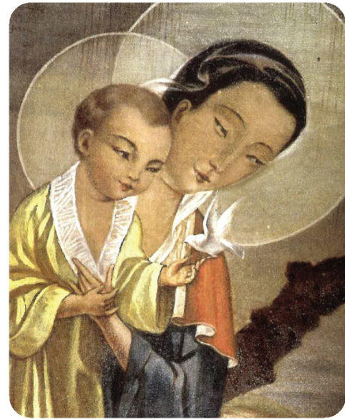
VIRGIN AND CHILD, ASIA (ARTIST UNKNOWN)

Recall, too, that Jesus and his disciples spoke Aramaic, and there is no equivalent for the meaning of "cousins" as we know it in that language. Instead, the word for brother or sister was used when referring to cousins. Thus, when St. Jerome ( circa 340-420) translated the Bible from Hebrew into Church Latin, he considered "the brothers of Jesus" as cousins, not siblings. After all, it would have been the rightful responsibility of these male relatives of Jesus to take care of Mary when Jesus died. Yet Jesus entrusts his mother to the care of his beloved disciple John (John 19:26). ●