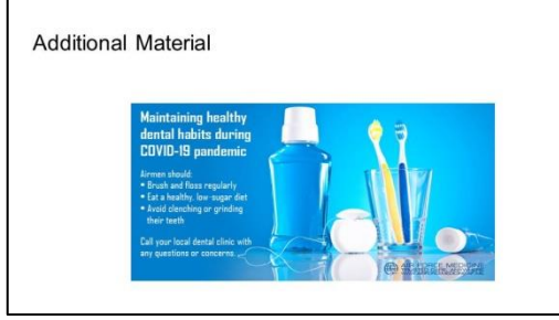
4 Sample slides from our Oral Health Care Seminar #1