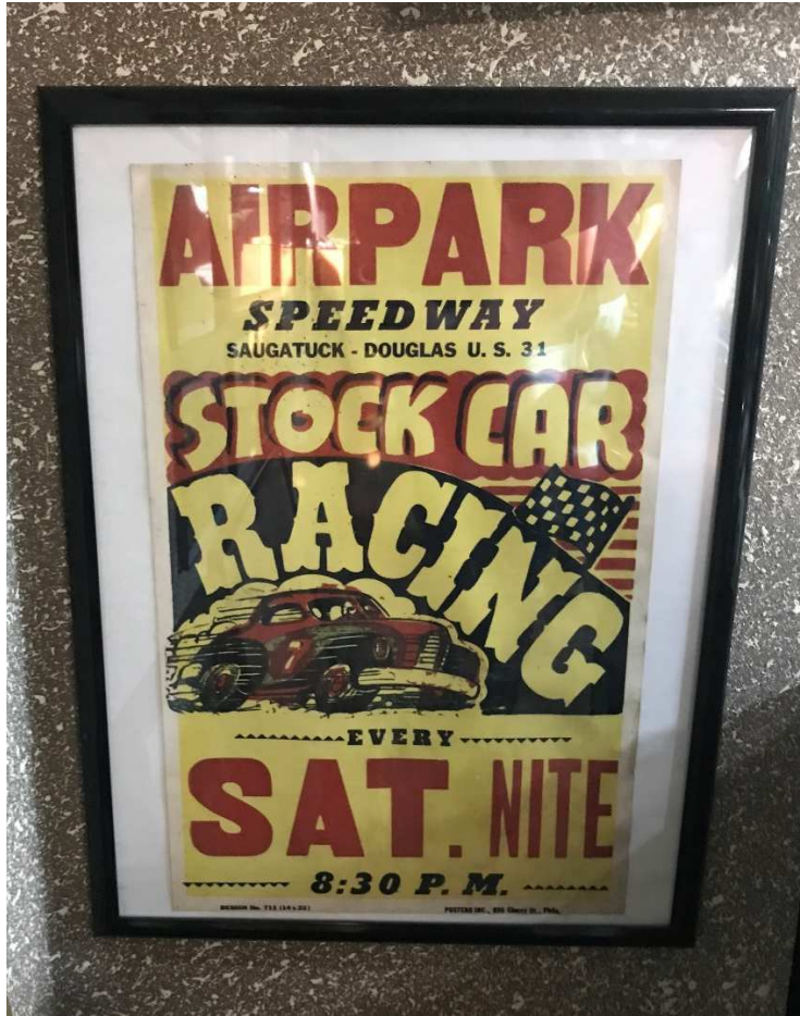
Anyone know where the Air Park Speedway was in Saugatuck?