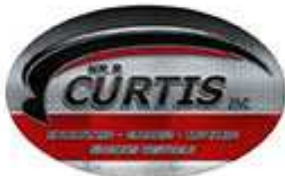
WM. R. CURTIS EXCAVATING

@ Bakers of Milford 2025 S. Milford Rd. Milford, MI 48381 Open to all Pontiac, Oakland, Buick, Oldsmobile & GMC Trucks