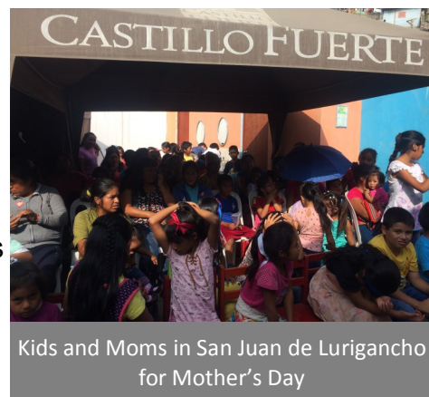
Kids and Moms in San Juan de Lurigancho for Mother's Day

We praise God that we had a successful meeting of the Peru Foro in April. We look forward to our next meeting at the end of the year. This year we had partners renew their commitment to the Foro as well as a new members join the Foro partnership. Thank you to all those involved in the Peru Foro. Your prayers, guidance and