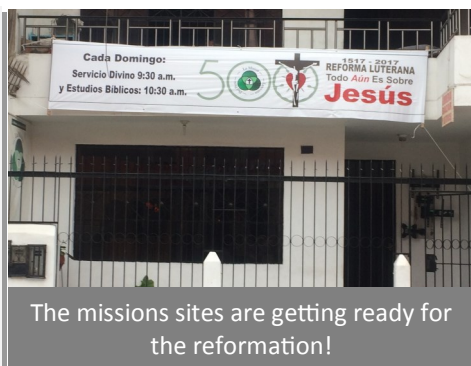
The missions sites are getting ready for the reformation!

There are many opportunities to serve as a short-term missionary. Check out the current list and download an application at www.lcms.org/service . Click on "Service