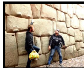
Ancient Inca Wall