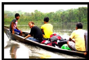
Travel by Canoe

At the present I find myself traveling between cities and the Amazon Jungle venturing amongst the tribes and writing about this to challenge you to give up your life and boldly follow JESUS CHRIST in a fulltime capacity.