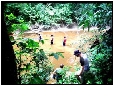
Amazon Game Hunt

amazonmissions@gmail.com www.amazonmissions.com