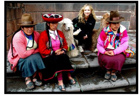
With Inca Women