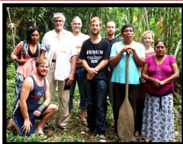
The Amazon Team

[Amazon Missions consists of 5 fluctuating groups of people reaching out together: (1) Ethnic Tribes, (2) Missionaries in local areas, (3) Overseas Part-Timers, (4) Official Outreach Teams from Southern Africa (overseas too) and (5) Local intercessors, propagators, financial supporters and practical helps volunteers.]