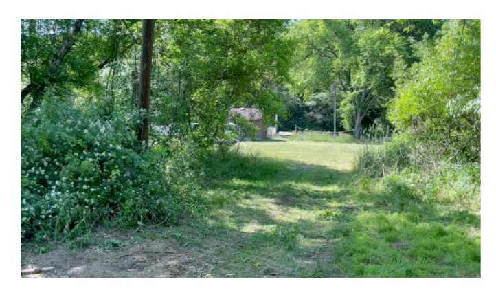
VIEW FROM THE NEW BOATING AREA TO THE POOL

The hope is, relocating the boat docks to a more central location will give the opportunity for more scouts to take advantage of the boating program.