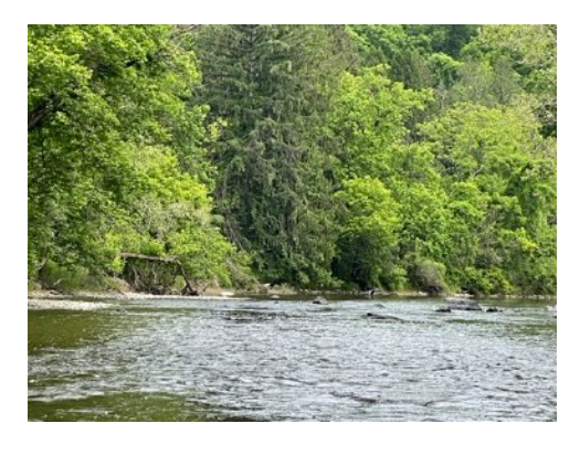
RIVER VIEW OF THE BOATING AREA

After some effort, the new boating area is ready for scouts!