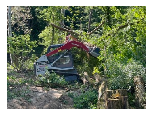
CLEARING THE AREA