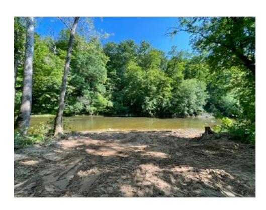
NEW BOATING AREA