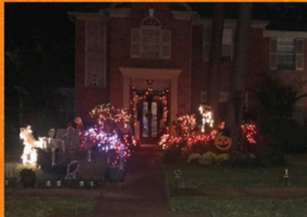
Section 1: 9207 Brahms Lane