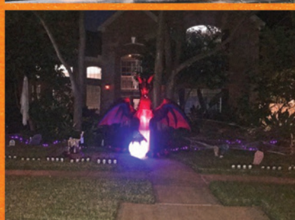
Section 3: 7922 Adagio Avenue