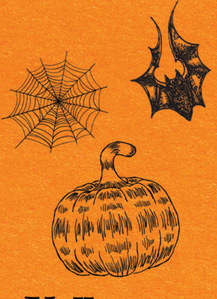
Halloween Yard of the Month