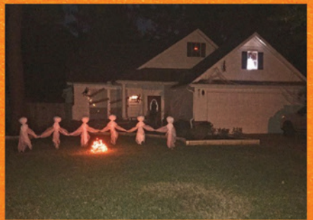
Section 4: 9331 Adagio Lane

Copyright © 2020 Peel, Inc. Woodwind Lakes - December 2020 1