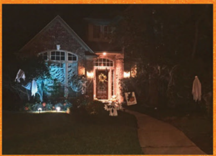
Section 2: 8107 Waynemer Way