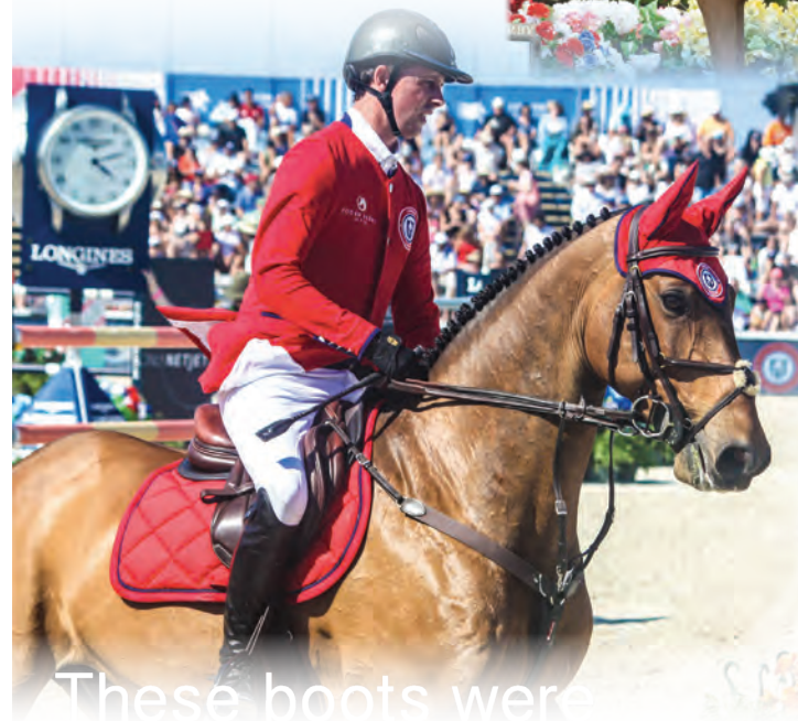
Ben Maher Multiple Olympic Gold Medalist