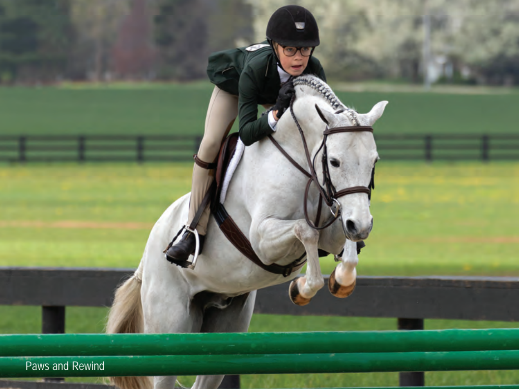
Paws and Rewind