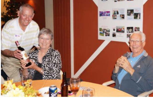
Visit the Country Coach Texans website for more photos from this rally: <u>www.cctexans.com</u>