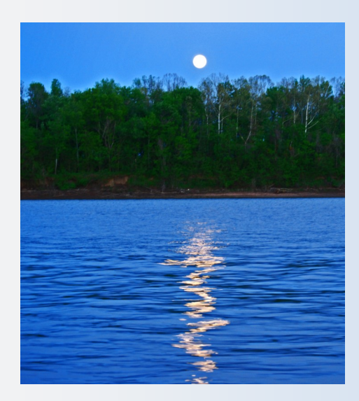
Moonrise over Tennessee River