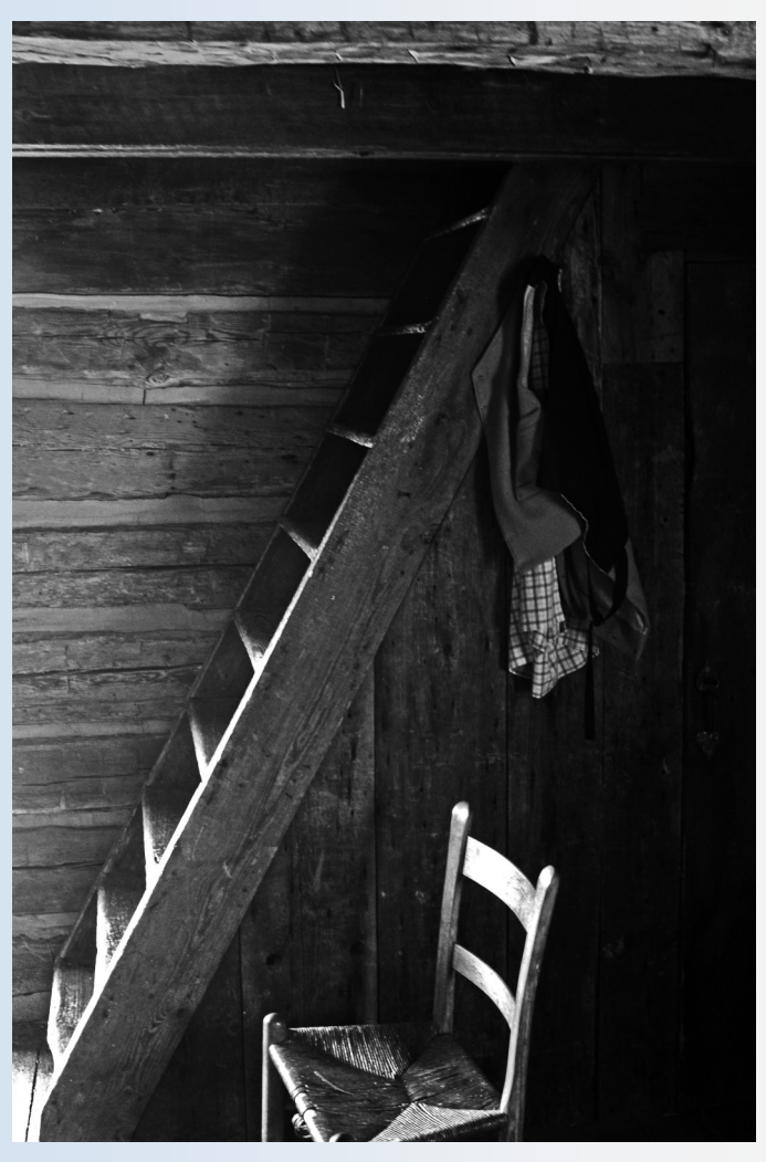
Stairs 6470 b and w