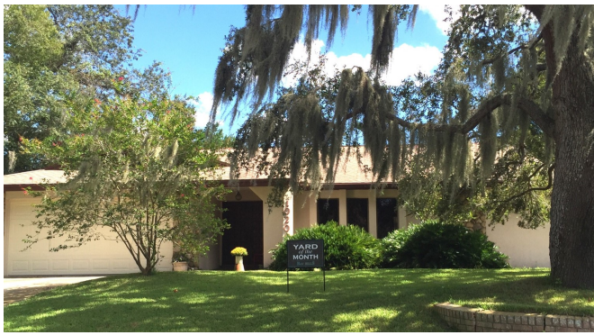
October Yard of the Month on Bay Hills Drive