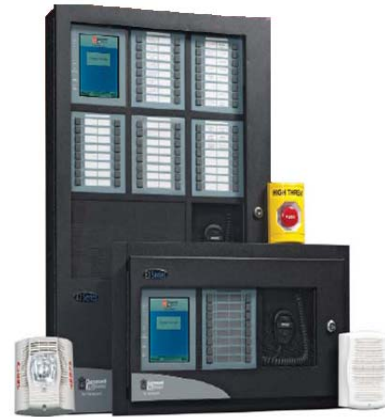
E3 Series Combined Fire and MNS System