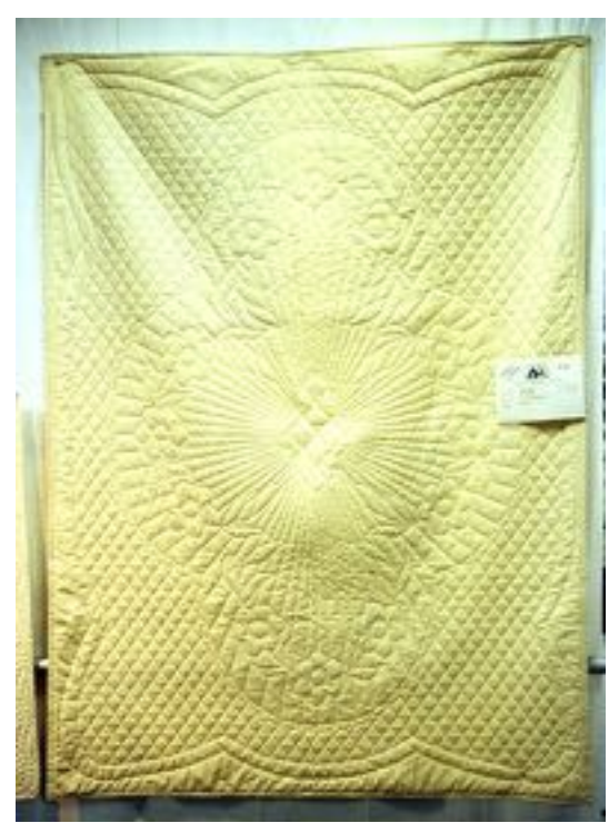
from The Quilt Index at Michigan State University quilt index.org