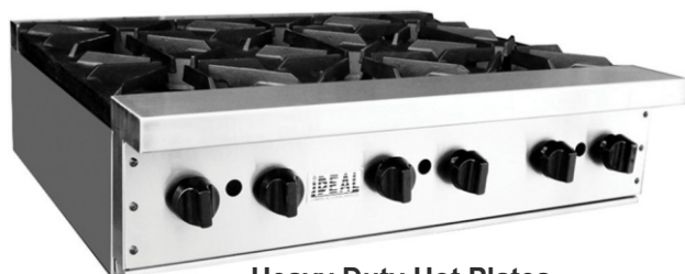
Heavy Duty Hot Plates