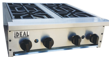
Snack Line Hot Plates