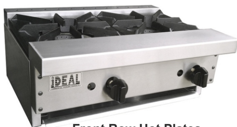
Front Row Hot Plates