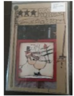
Joy Snowman Dusti Dancer November