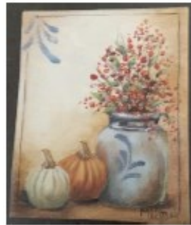
Pumpkins & Crock Linda McDonald September