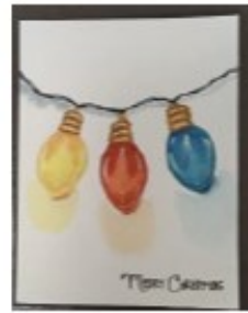
Lights Notecard Sharlene King October