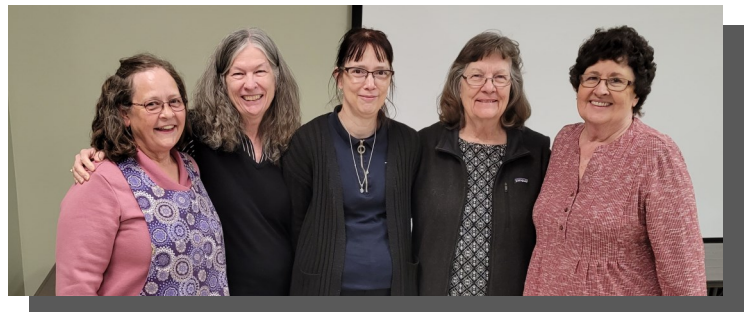
2023 Elected Officers