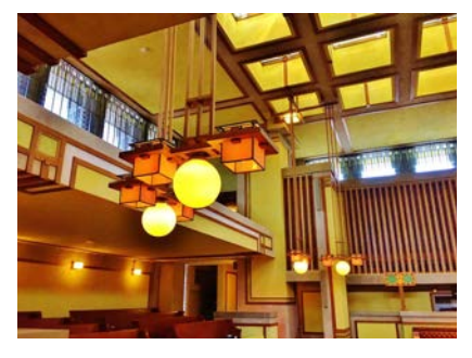
Showing off our wonderful architecture at Wright's Unity Temple in Oak Park and on the Chicago River.

Wheaton. Home of famous Chicagoan Col. Robert McCormick, the long-time publisher of the Chicago Tribune , the park includes extensive gardens and a comprehensive war museum.