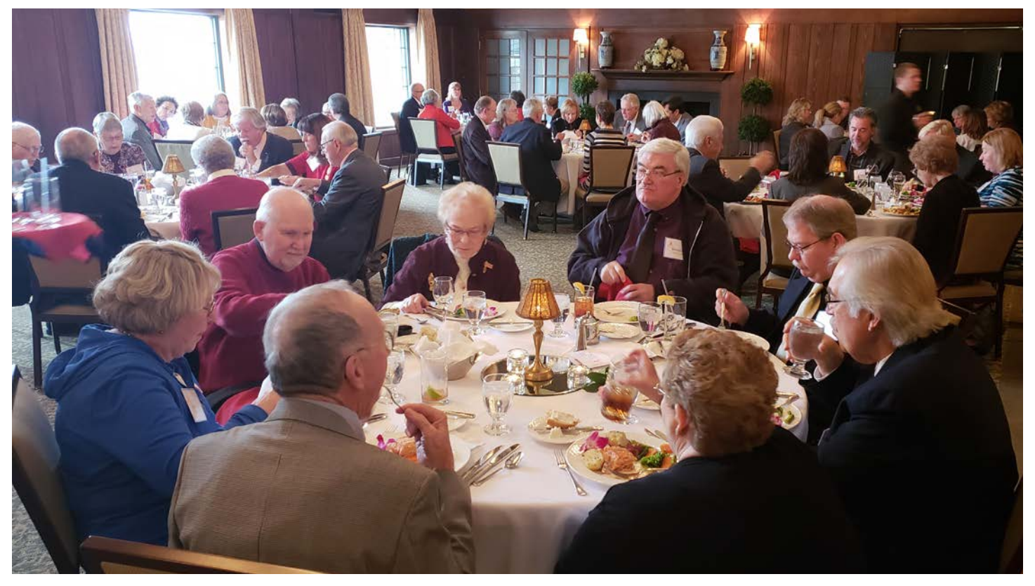
The Bloomington Country Club provided a warm setting on a gloomy day for the 75 members, applicants and guests.