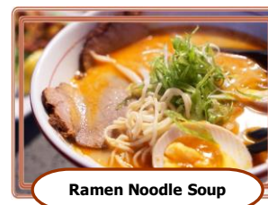
Ramen Noodle Soup