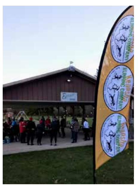
Click to see more photos...