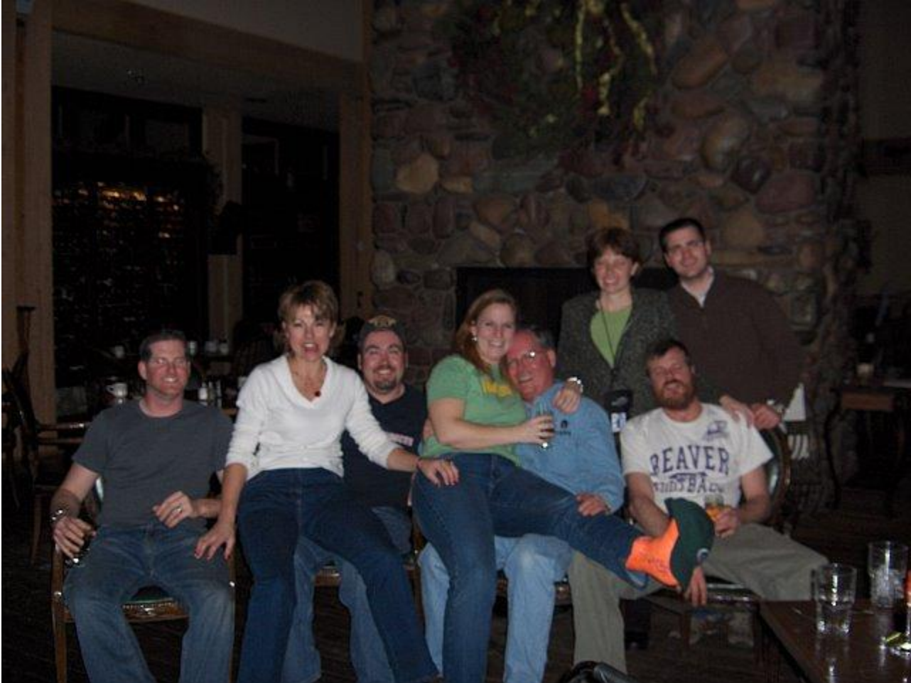
The late night bar crowd: