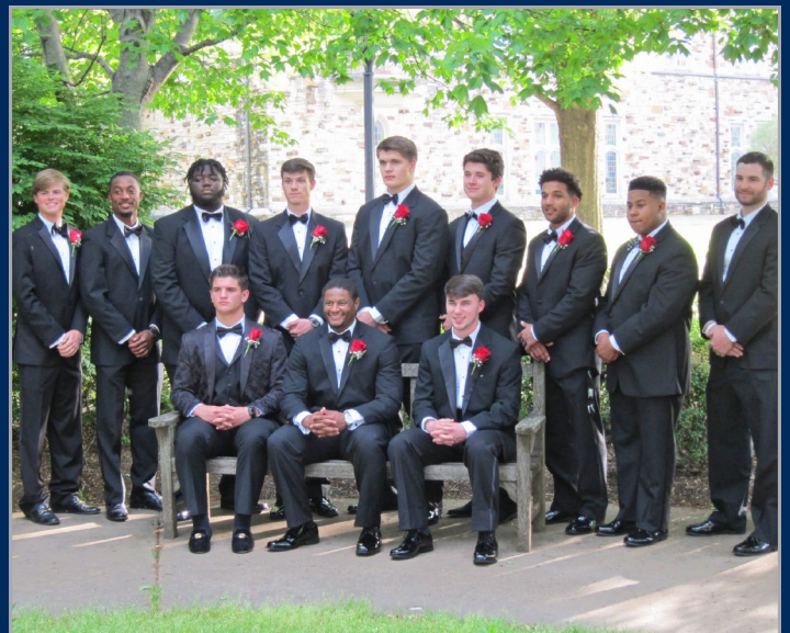
Twelve high school superstars were recognized for their overall accomplishments and all were presented with a scholarship.