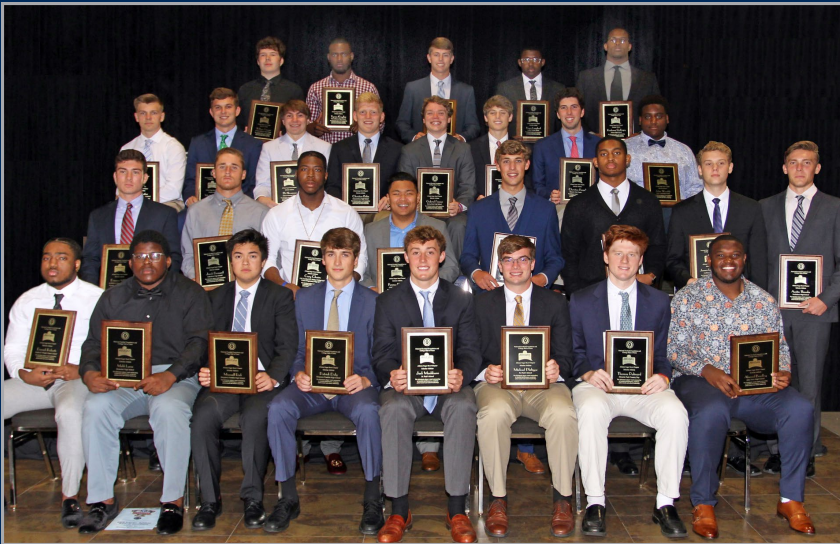
Twenty-nine local high school football players were recognized for their achievements in the classroom, in the community and on the field. The event was held in the St. Charles Room at the Mercedes-Benz Superdome.