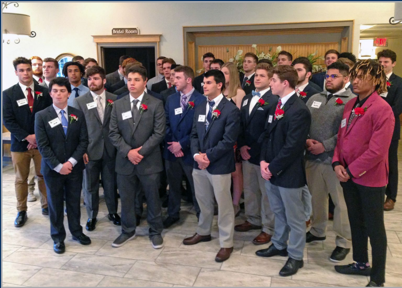
Thirty-eight scholar-athletes from the state of New Hampshire were honored for their prep achievements. Twenty-one of these young athletes will play football in college.