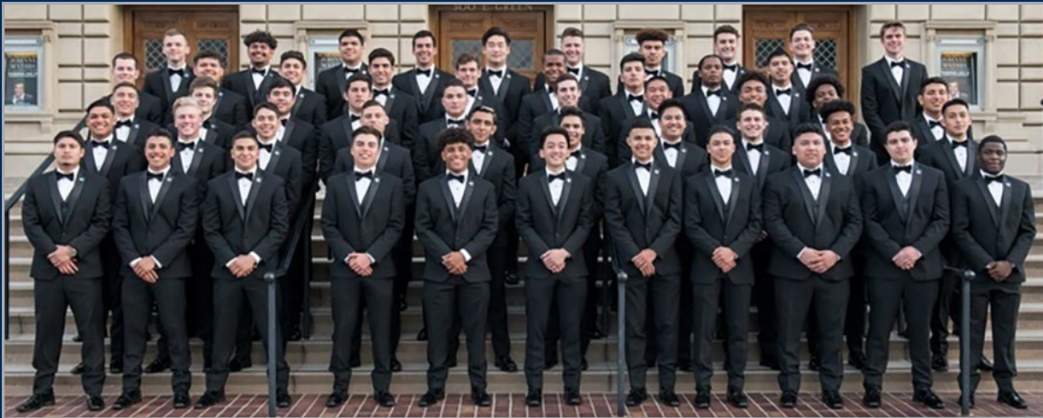
Fifty-three high school standouts gathered at the Pasadena Convention Center for the chapter's 49th annual installment.

49TH ANNUAL BANQUET & COACHES MIXER HIGHLIGHT BUSY AGENDA.