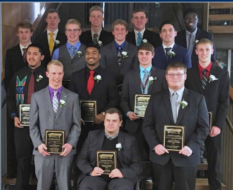
The top 15 high school scholar-athletes in Wyoming were selected from 127 nominations and each received a $1,200 scholarship.