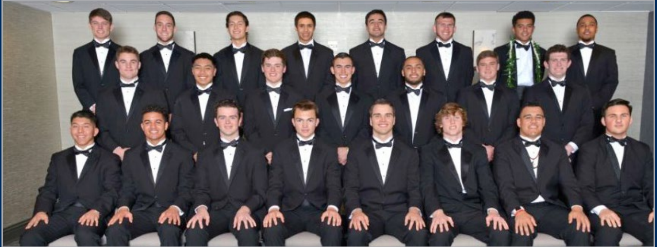
Twenty-four of the best and brightest high school scholar-athletes from the San Francisco area were honored and each received a $1,000 scholarship.

$24,000 IN SCHOLARSHIPS DISTRIBUTED, BRINGING ALL-TIME TOTAL TO $912,000.