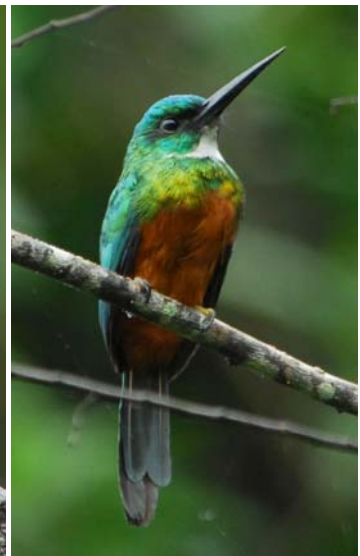
Paradise Jacamar; Brown Jacamar; Green-tailed Jacamar