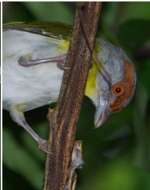
Southern Beardless-Tyrannulet; Rufous-browed Pepper-Shrike