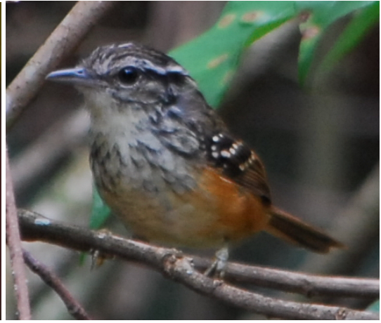
Musician Wren; Warbling Antbird