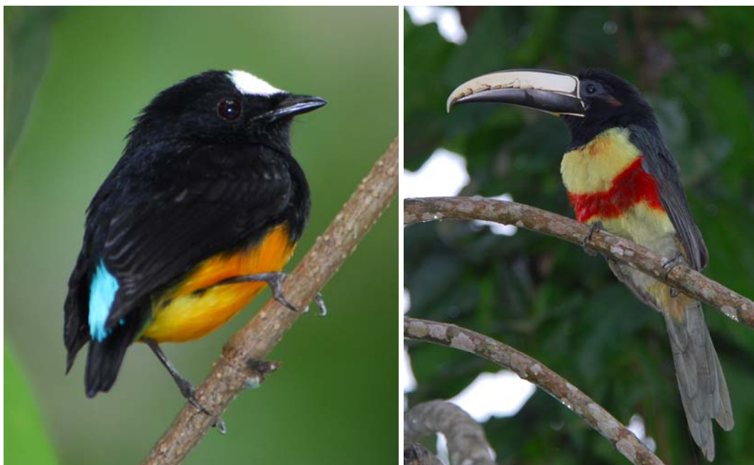
Orange-bellied Manakin; Black-necked Araçari

This report covers highlights (images, some contact details and a trip list) from a trip to south-eastern Venezuela ... a more detailed report will follow. The trip concluded with a personal total of some 303 confirmed species, including 54 "first time ever" species to add to my Venezuelan list. This included a total of 24 Hummingbird, 24 Antwren/Antbird/Antshrike, 13 Cotinga/Piha/Bellbird and 9 Manakin species. The number of Antwrens/Antbirds/Antshrikes was far more than I have ever seen or photographed on a single trip and a direct result of putting my newly acquired iPod into action for the first time.