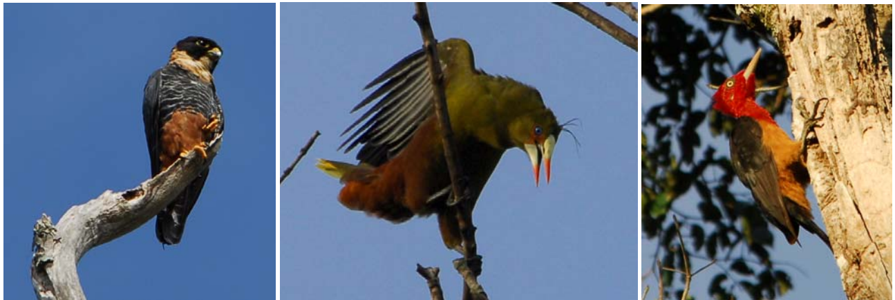
Bat Falcon; Green Oropendola; Red-necked Woodpecker