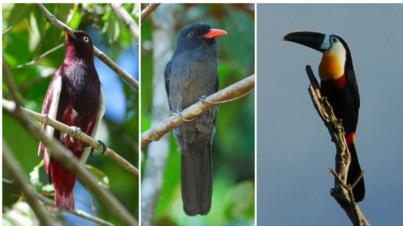
Pompadour Cotinga; Black Nunbird; Channel-billed Toucan