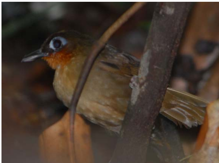
Mouse-colored Antshrike; Rufous-throated Antbird