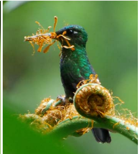
Crimson Topaz (f) and Rufous-breasted Hermit; Velvet-browed Brilliant (collecting nesting material?)