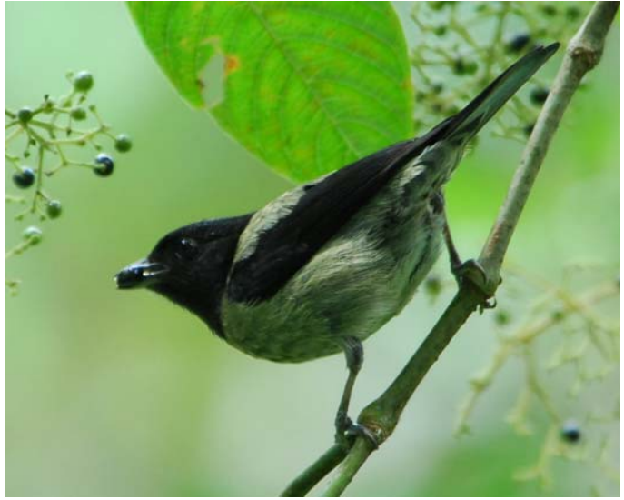
Rufous-breasted Sabrewing; Black-headed Tanager