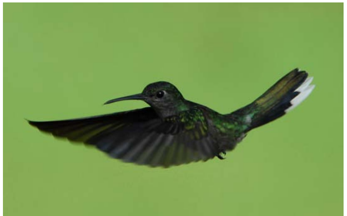
Rufous-breasted Hermit; Gray-breasted Sabrewing