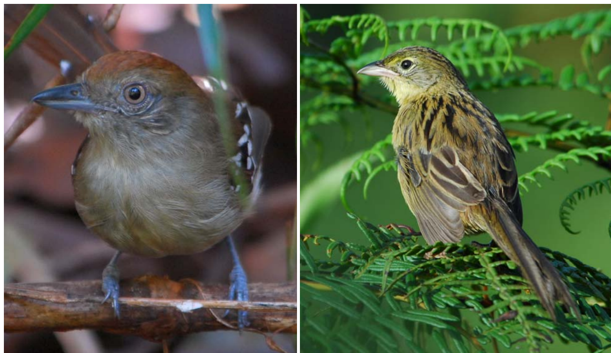
Guianan Slaty-Antshrike (f); Wedge-tailed Grass-Finch