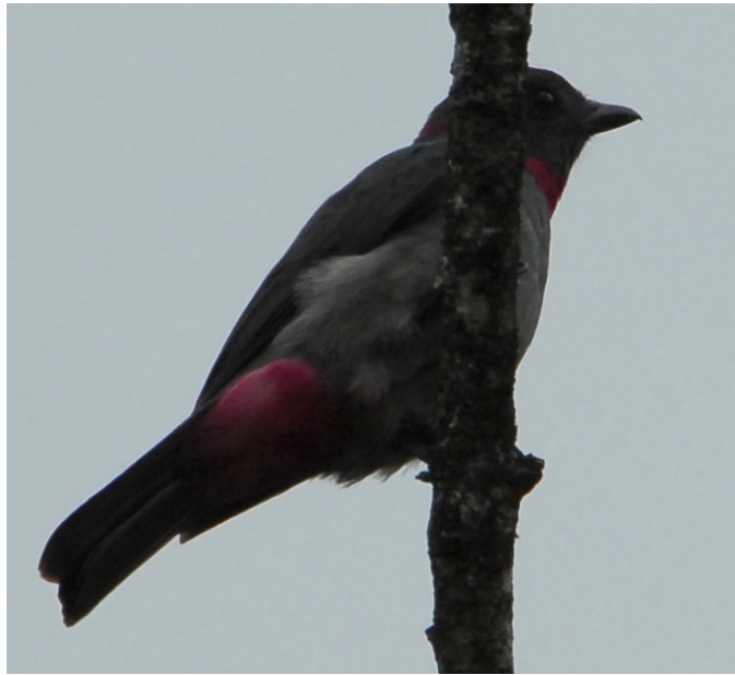
Bearded Tachuri (f); Rose-collared Piha