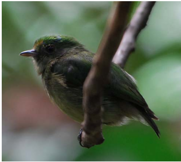
Golden-headed Manakin; Blue-crowned Manakin (imm.)