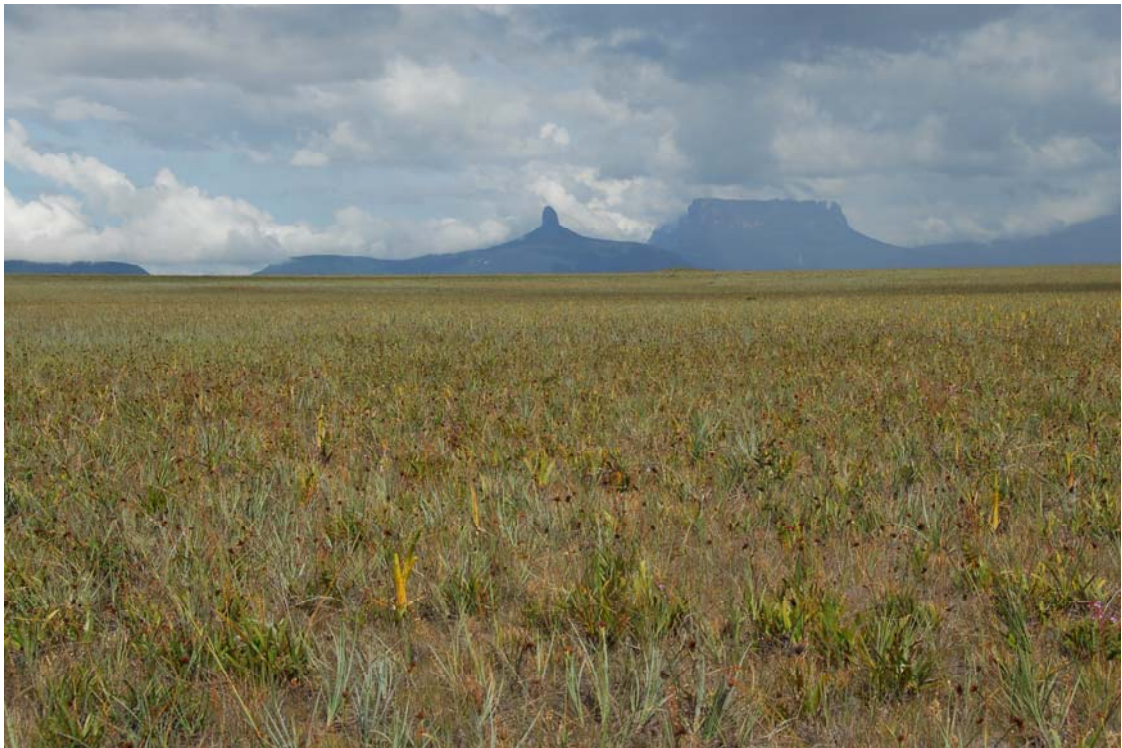
Gran Sabana panorama towards Wadakapiapué and Yuruaní Tepuis