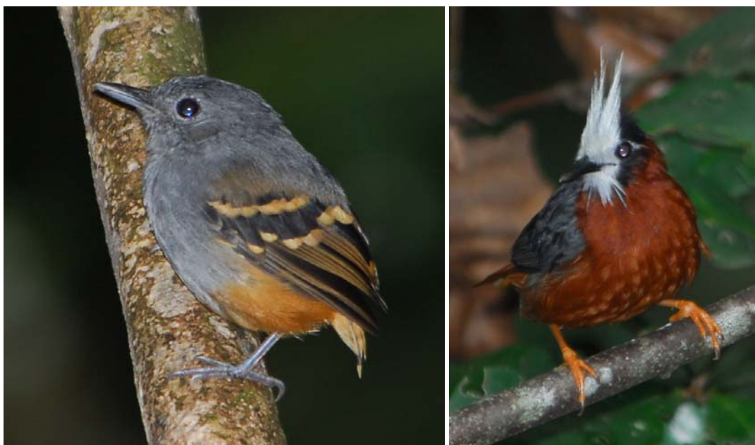
Rufous-bellied Antwren; White-plumed Antbird