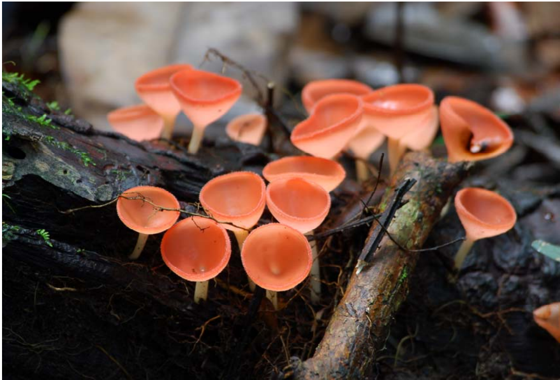
Transparent mushrooms on Rio Grande trail, Imataca