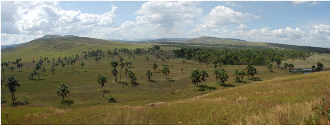
Morichal in the southern Gran Sabana