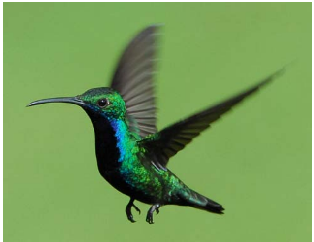
White-necked Jacobin; Black-throated Mango