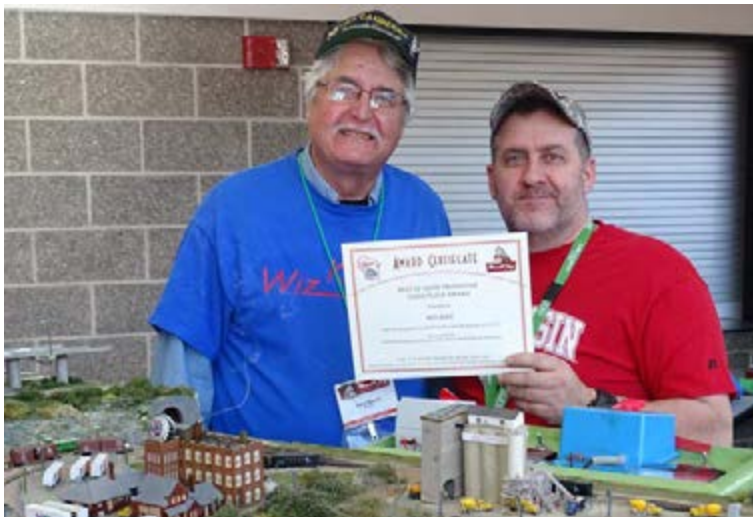
3rd Place WIZ KIDZ