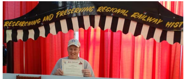
2nd Place Exhibit Lake States Railway Historical Society