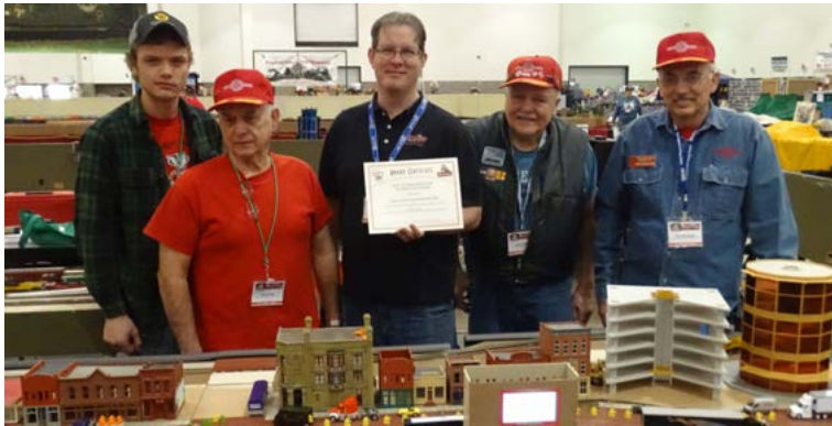
2nd Place Cedar Creek Central Railroad Club