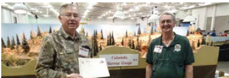
Colorado Narrow Gauge