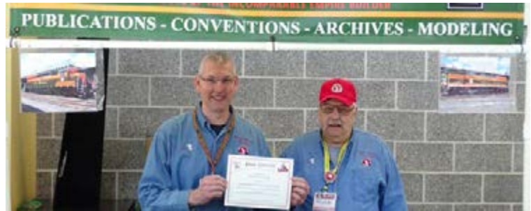
1st Place Exhibit Great Northern Railway Historical Society