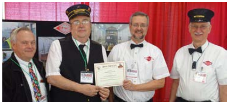
3rd Place Exhibit East Troy Railroad Museum

For more SCWD and NMRA news and information go on-line to our web site at www.nmra-scwd.org and visit the Bad Order on our web