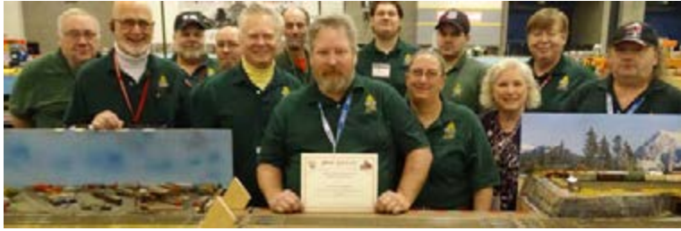
1st Place Capital City N'gineers