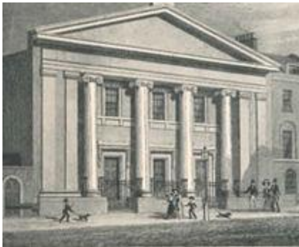
South Place Chapel, Finsbury

In 1817 William Fox took over at Parliament Court and by 1824 the Unitarian Ethical Society had built a new chapel at South Place, Finsbury. They then renamed themselves the South Place Religious Society. Moncure Conway took over as minister in 1864 and by 1888, having rejected the existence of God, the society had become the South Place Ethical Society. In 1929 this society moved to new premises at Conway Hall, Red Lion Square, Bloomsbury. In 2012 the name changed again to Conway Hall Ethical Society and is a home for Humanism.