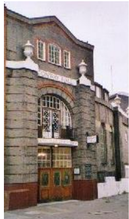
Conway Court, Bloomsbury

Until the passing of the Doctrine of the Trinity Act in 1813 it was a criminal offence for ministers to deny the Trinity. The Unitarian doctrine continued and the British and Foreign Unitarian Association was formed in May 1825 as an amalgamation of the Unitarian Book Society for Literature, The Unitarian Fund for Mission work, and the Unitarian Association for Civil Rights. In 1928 it became part of the General Assembly of Unitarian and Free Christian Churches. Unitarians now celebrate diverse beliefs, helping people to find their own spiritual path rather than defining it for them. There is still a Unitarian church in Hastings, founded in 1868.