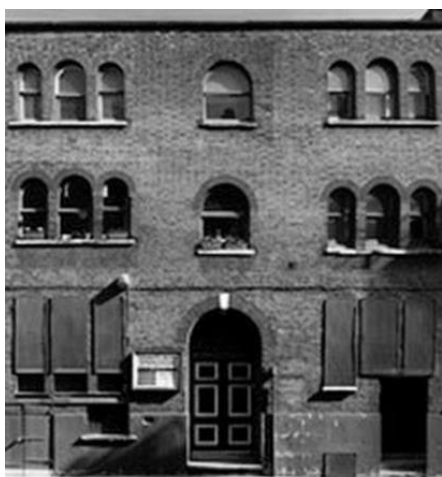
Parliament Court, now Sandys Row Synagogue