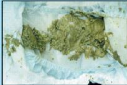
The poop turns green by Day 3 or 4.