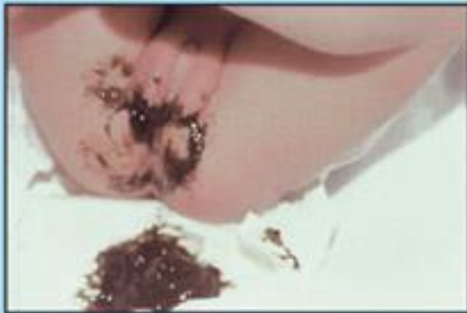
The baby's first poop is black and sticky.

The baby's poop should change color from black to yellow during the first 5 days after birth.