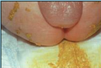
Poop can look seedy.