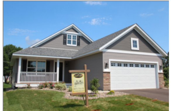
PHOTOS OF PREVIOUSLY FINISHED HOME