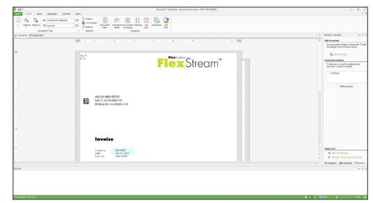
Simplex documents printed to duplex