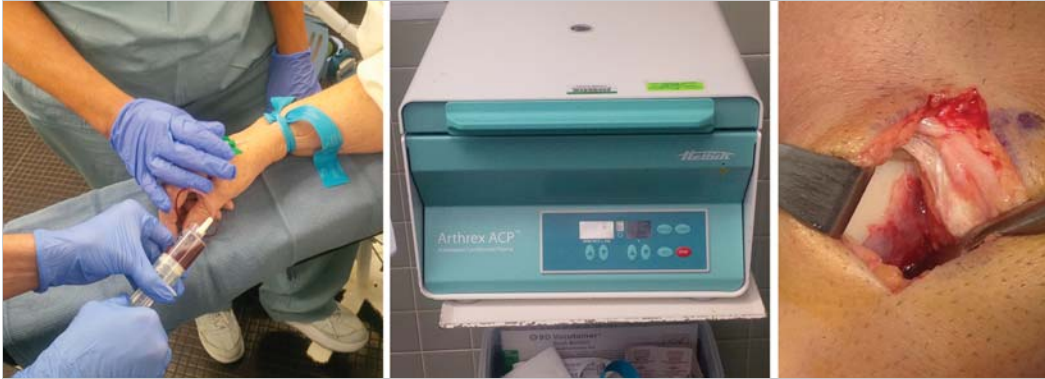
Fig. 6.2 (A) A blood draw is performed on the patient intraoperatively after the induction of anesthesia. (B) The blood is spun down in a centrifuge to separate out the platelet-rich plasma. (C) The platelet-rich plasma is placed at the microfracture site with a fibrin glue sealant.

systematically reviewed and analyzed randomized controlled trials of injection therapies for patients with lateral epicondylitis, and determined that PRP was statistically superior to placebo, although most studies were at risk for bias using the Cochrane risk of bias tool. Carter et al 31 analyzed 24 articles evaluating PRP use in advanced wound therapy and concluded that PRP therapy in cutaneous wounds showed improved partial and complete wound healing compared with wound care alone in a control group. Villela et al 32 reported similar conclusions in the treatment of diabetic ulcers with PRP. These additional uses for PRP continue to be studied with higher levels of evidence, with the hope that more definitive conclusions can be made either in favor of or against routine use in the orthopedics.