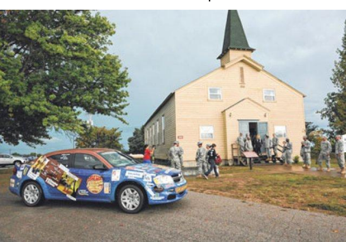
Fireball Run racecar in front of the FLW Museum's chapel.

October 2<sup>nd</sup>, the Fireball Run Adventurally Show filmed at the Museum. Race participants had to find the Berlin wall, three artifacts within the Museum, and the World War Two chapel within the Fort Leonard Wood Museum. In all, forty race teams visited the Museum complex.