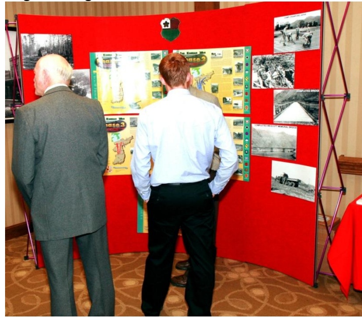
Display set-up for 13<sup>th</sup> Engineer's reunion.

The 13<sup>th</sup> Engineer Battalion visited the last week of September. After enjoying a visit to the Engineer and Fort Leonard Wood Museums, the Veterans and family of the 44<sup>th</sup> held their banquet in Waynesville. The 2014 reunion season ended the first week of October with the 97<sup>th</sup> Engineer Battalion reunion. The 97<sup>th</sup> added their unit plaque to the over 100 other unit plaques adorning the walls of the Engineer Regimental Room.