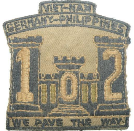
Unauthorized pocket patch worn by members of the 102<sup>nd</sup> Engineer Company in Vietnam. The 102<sup>nd</sup> spent the majority of their time in Vietnam assigned to the 815<sup>th</sup> Engineer Battalion.

In 2015, a new exhibit about unauthorized Engineer insignia of the Vietnam War will open. The exhibit will feature two "Jungle Fatigue" shirts with unauthorized insignia and about 12 loose patches. Each patch will be numbered. The visitor can touch the corresponding number on a computer screen and see a short slide show about the patch and/or the history of the unit.