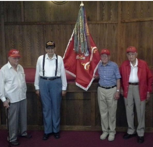
WW2 Veterans from the 51<sup>st</sup> Engineer Battalion donate their Battalion Colors to the Museum.

2014 will be a record-setting year in many areas: most important being reunion groups visiting the Engineer Museum. Since the last newsletter, seven reunion groups have visited the Engineer Museum. September started with the 19<sup>th</sup> Engineer Battalion holding their annual reunion in the Waynesville Park. The second week of September saw three reunions in one week: the 51<sup>st</sup> Engineer Battalion (WW2), the 84<sup>th</sup> & 62 Engineer Battalion (Korean War), and the 595<sup>th</sup> Engineer Company (Vietnam).