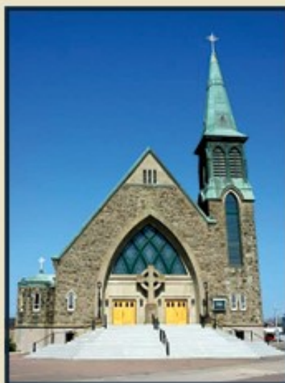
Saint Augustine's Moncton