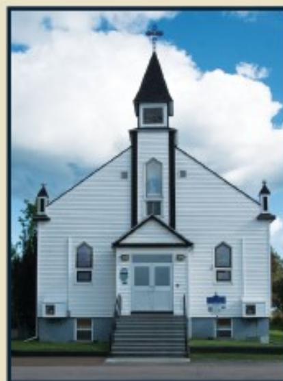
Our Lady of Mercy Pointe-du-Chêne