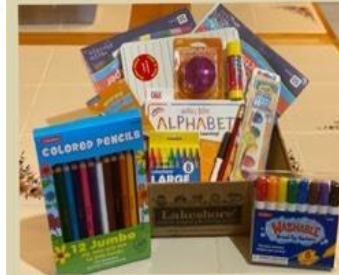
ACELERO LEARNING AT HOME KIT

PLEASE VISIT WWW.ACELERO.NET TO FIND A LOCATION NEAR YOU OR CALL (215) 235-3196 / (856) 203-3473 TO ENROLL NOW!!