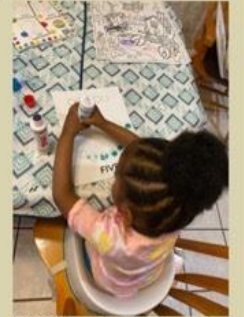
HANDS ON ACTIVITIES