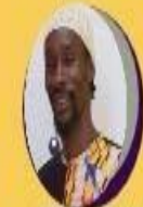
CORBIN RODA'IAH BEN LEVI, OR PANEL DISCUSSION FAMILIES