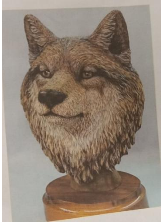
Wolf $38 Plus Shipping